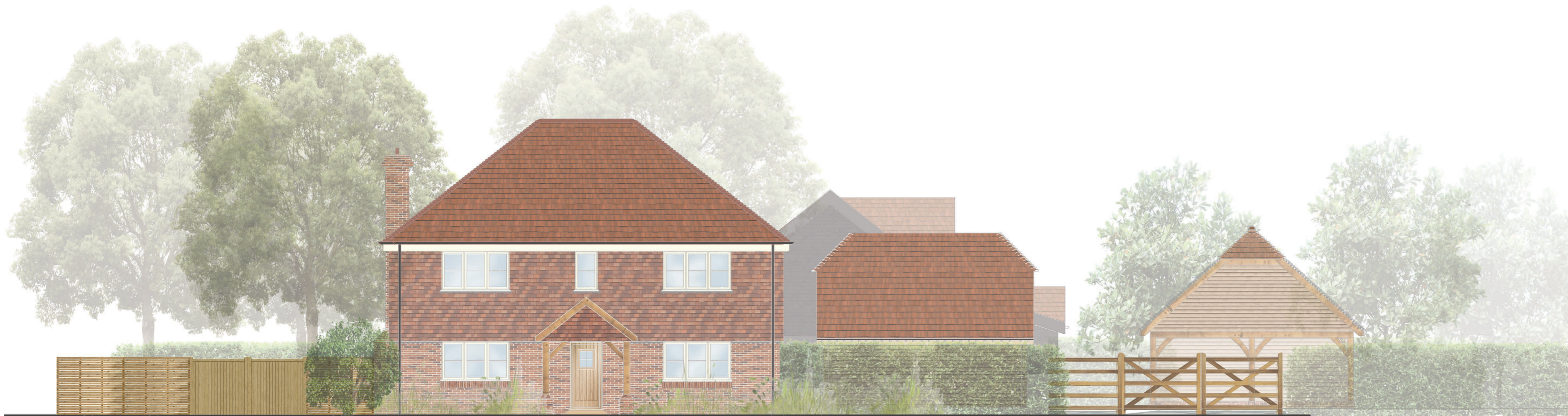
SOUTH WEST CONTEXTUAL