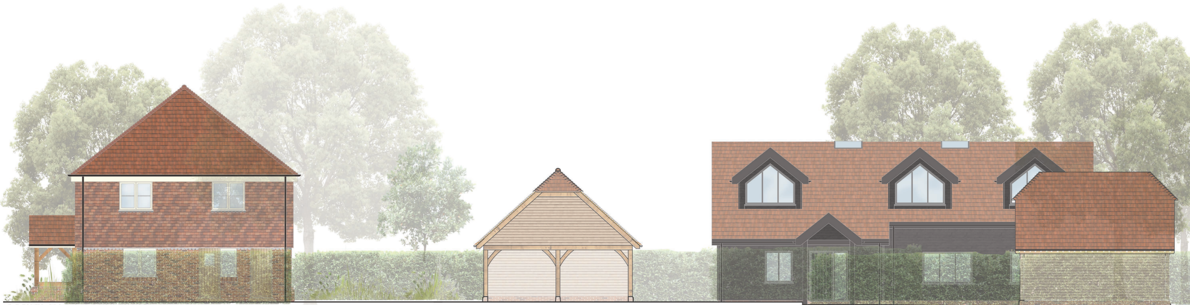
SOUTH EAST CONTEXTUAL