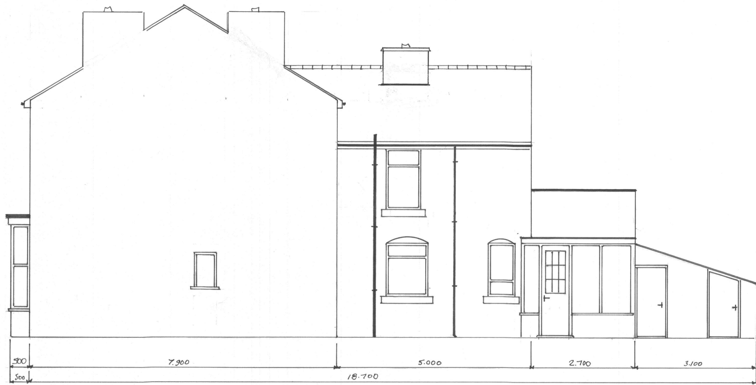
EXISTING SIDE ELEVATION B