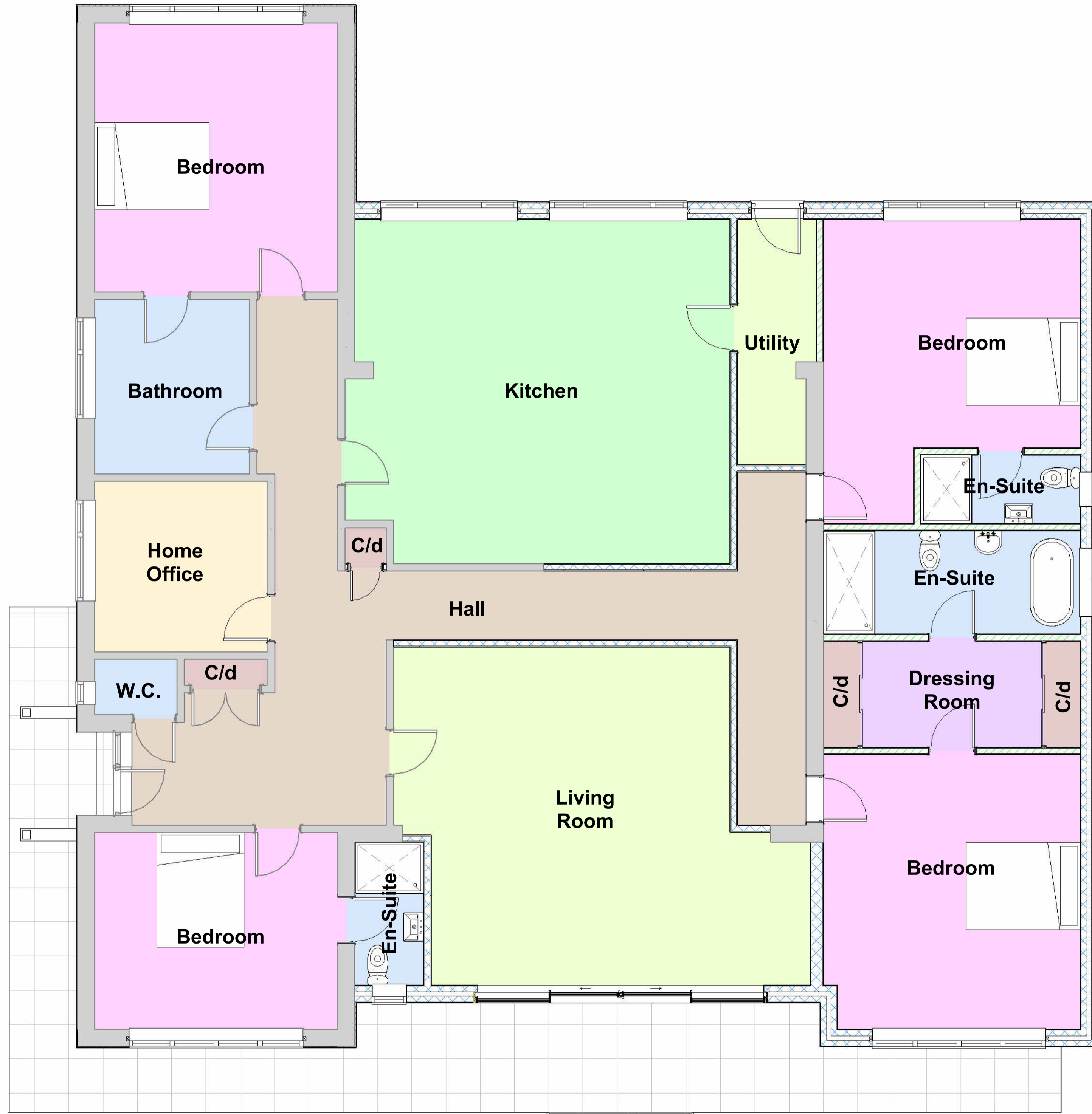
Proposed Ground Floor