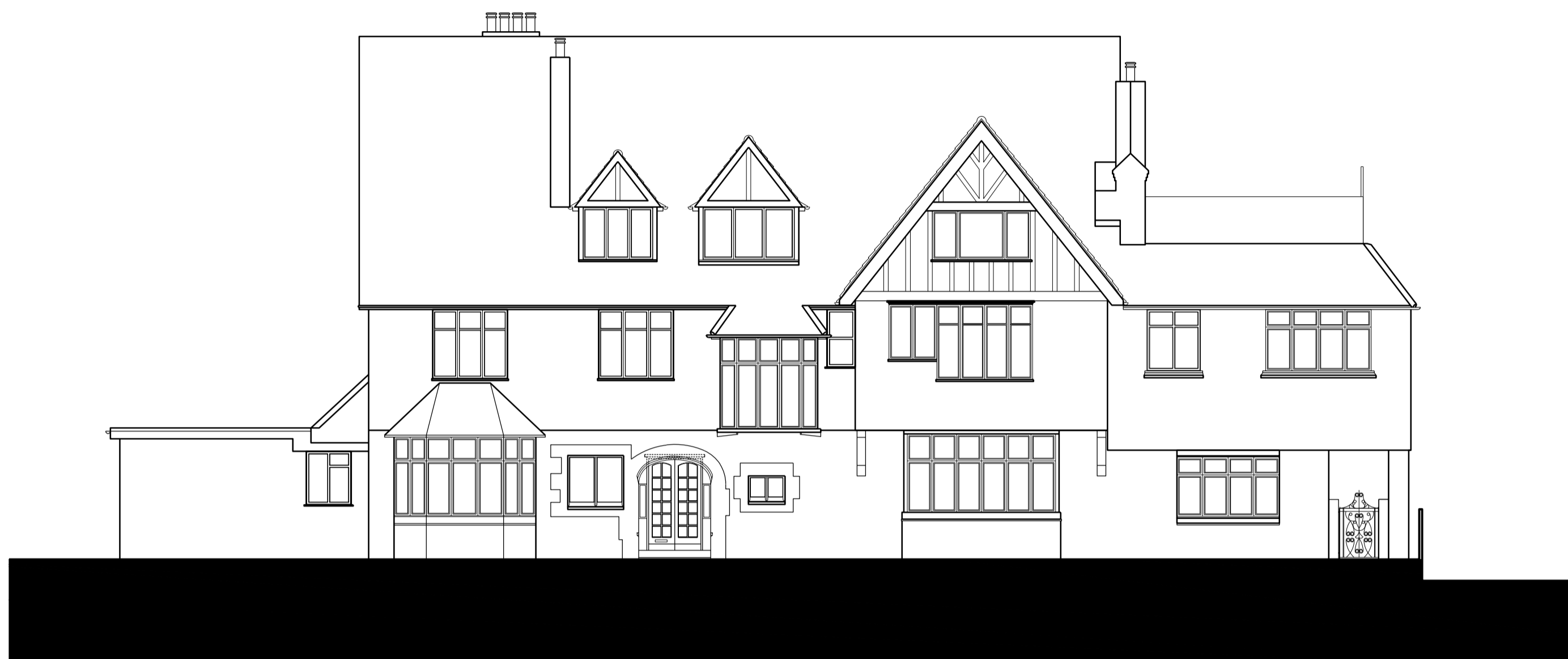
1 ELEVATION Existing Front (South) Elevation SCALE 1: 100