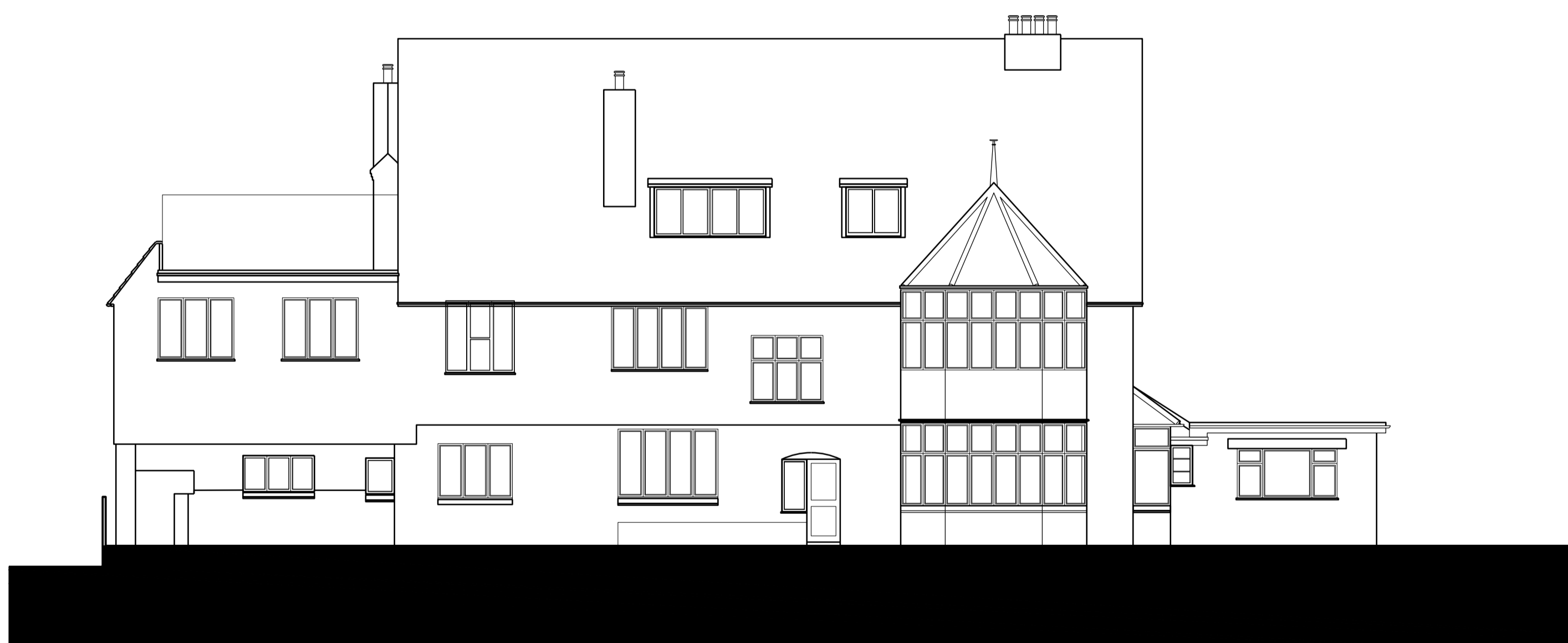
3 ELEVATION Existing Rear (North) Elevation SCALE 1: 100