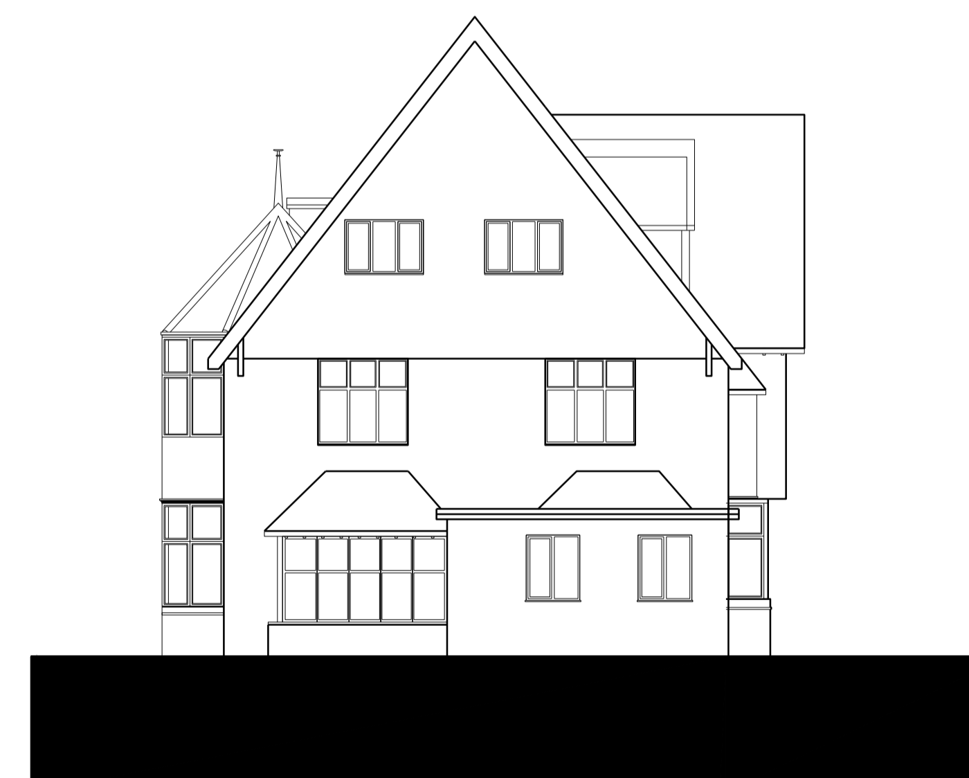
4 ELEVATION Existing Side (West) Elevation SCALE 1: 100