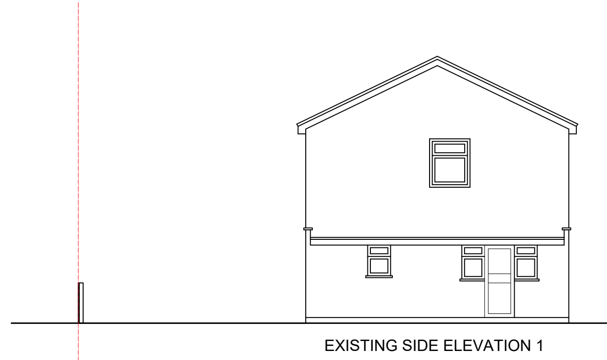
EXISTING SIDE ELEVATION 1