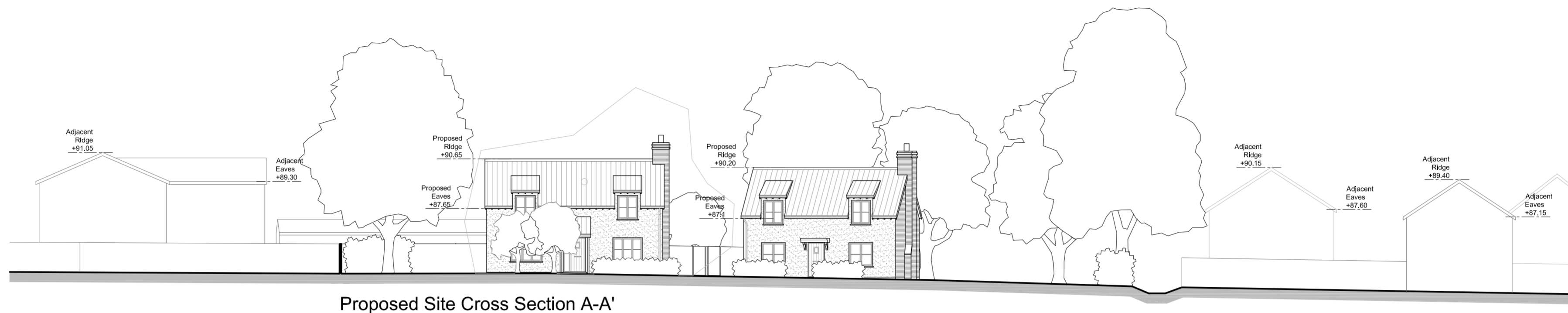
Proposed Site Cross Section A-A'

GENERAL NOTES: 1. THIS DRAWING IS TO BE READ IN CONJUNCTION WITH THE OTHER RELEVANT CONSULTANTS DRAWINGS. 2. ALL FINISHES ARE TO CONFORM TO THE CURRENT BUILDING REGULATIONS. 3. REFER TO A SEPARATE DOCUMENT FOR THE DESIGNERS RISK ASSESSMENT. 4. ALL WORKS OR MATERIALS INDICATED ON THIS DRAWING ARE TO BE TO THE LATEST RELEVANT BRITISH STANDARDS AND CARRIED OUT IN ACCORDANCE WITH THE BRITISH STANDARDS CODES OF PRACTICE OR RECOGNIZED INSTITUTE OR TRADE ASSOCIATION RECOMMENDATIONS AND PUBLICATIONS.