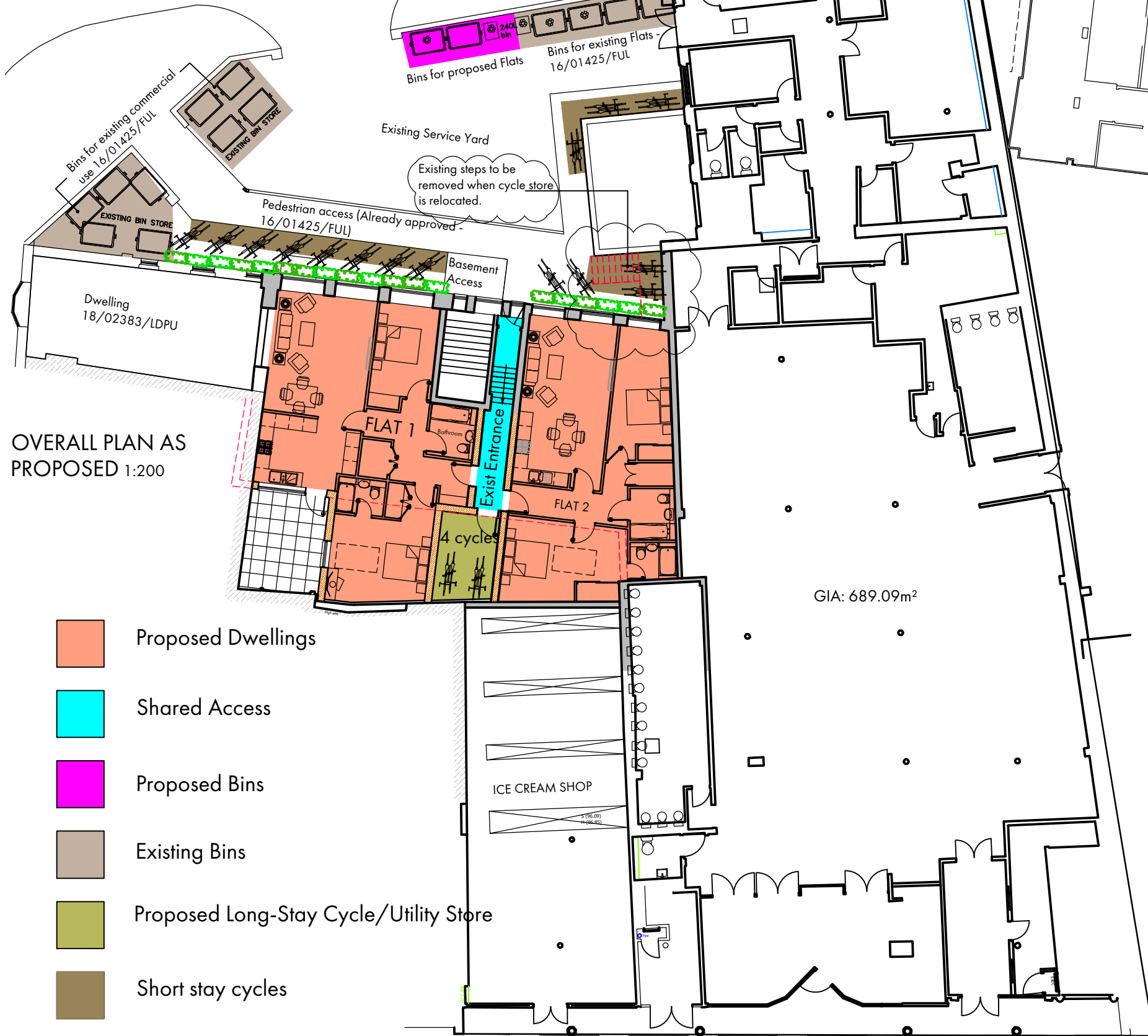
OVERALL PLAN AS PROPOSED 1:200