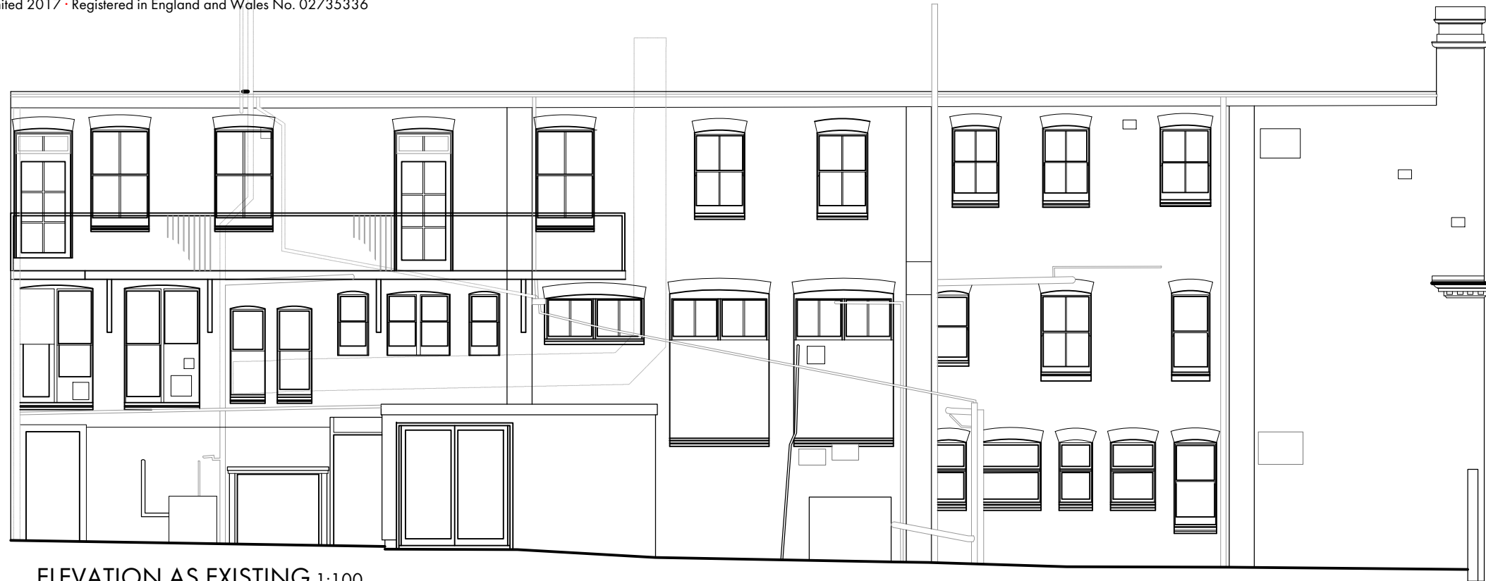
ELEVATION AS EXISTING 1:100