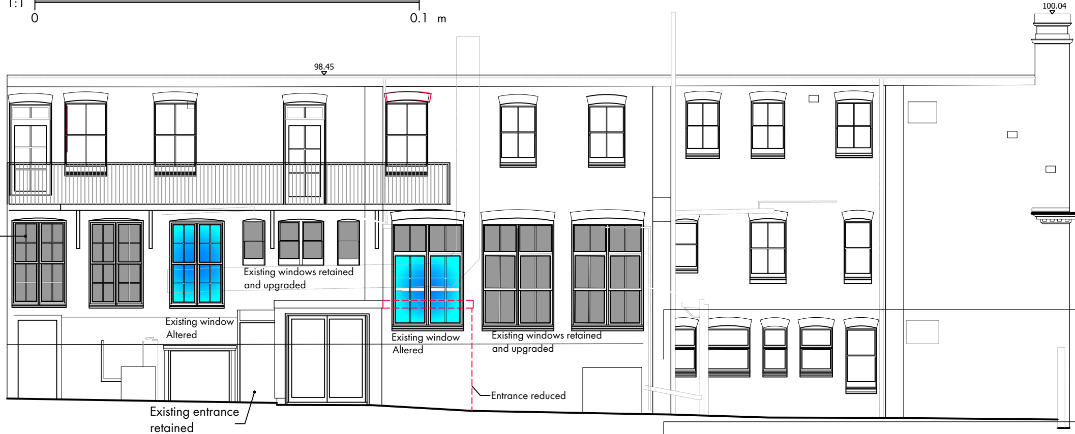
ELEVATION AS PROPOSED 1:100

GLAZING AND VENTILATION: All new glazing and ventilation to be as recommended in the Noise Impact Assessment Report 2194.NIA.01