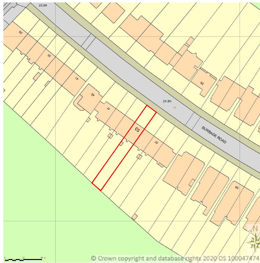
LOCATION PLAN Sc. 1/1250