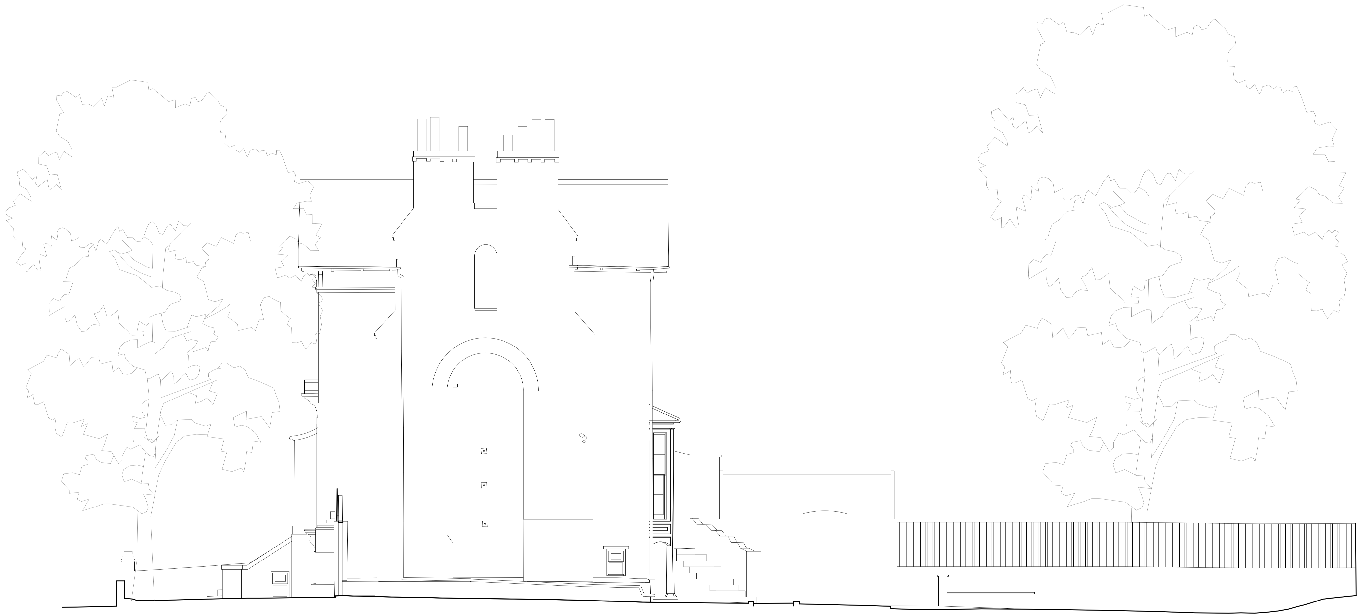
2 EXISTING SIDE ELEVATION Scale: 1:50