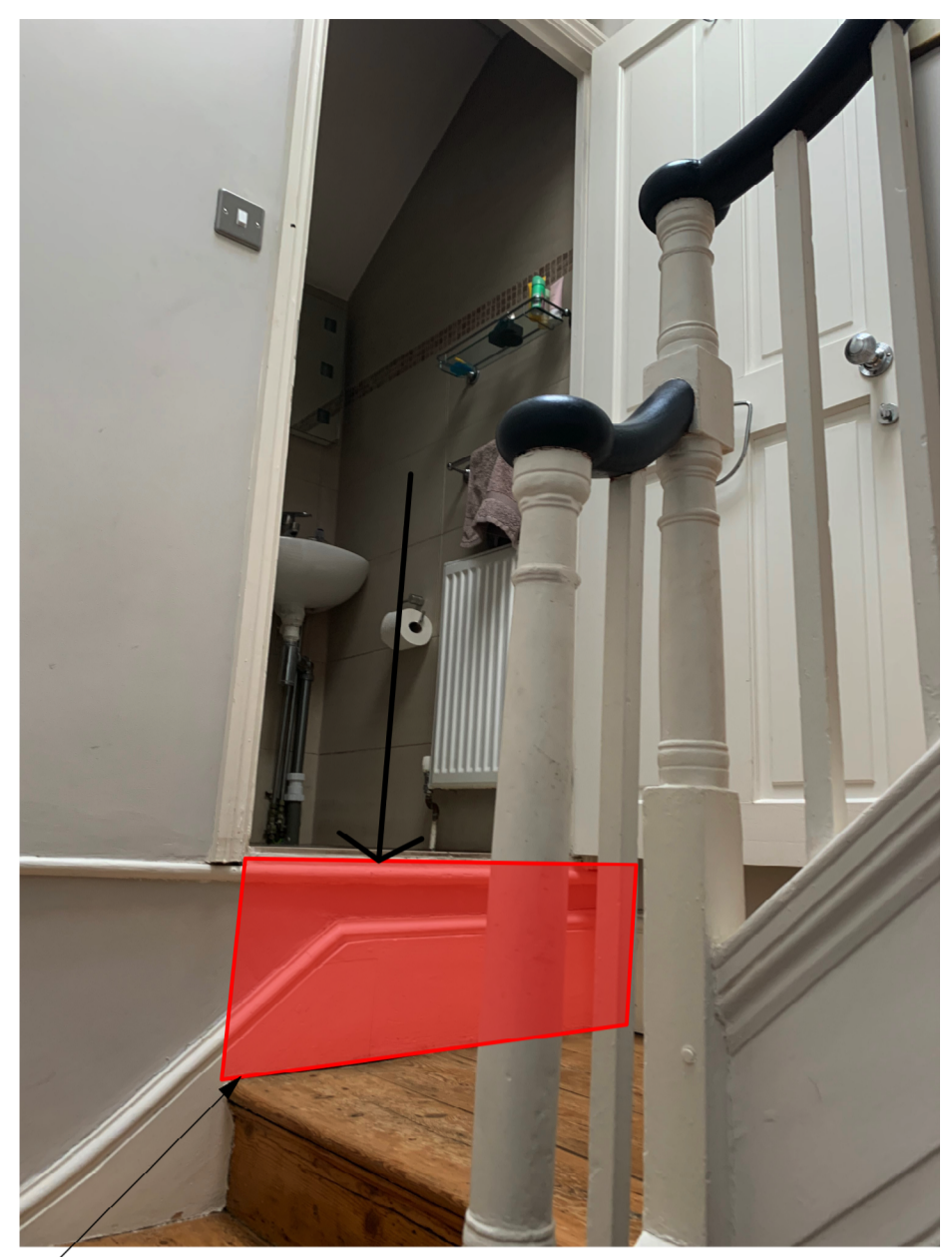
EXISTING SECOND FLOOR HALF LANDING SHOWER

OUTRIGGER FLOOR LEVEL LOWERED BY 128MM TO BE MADE LEVEL WITH STAIRCASE LANDING