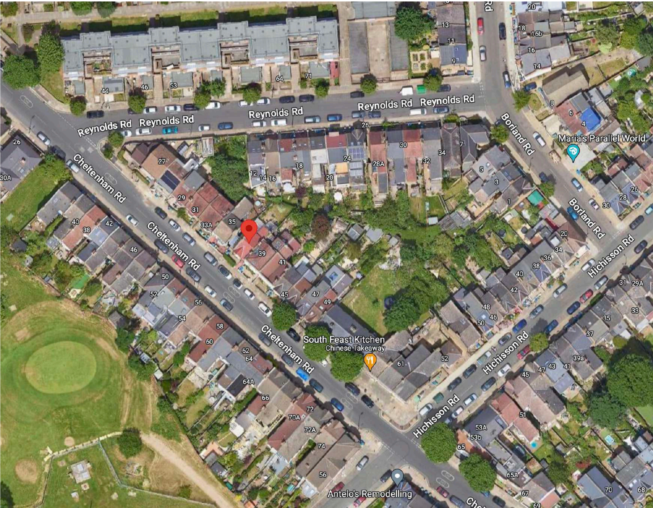
Google maps image of terrace