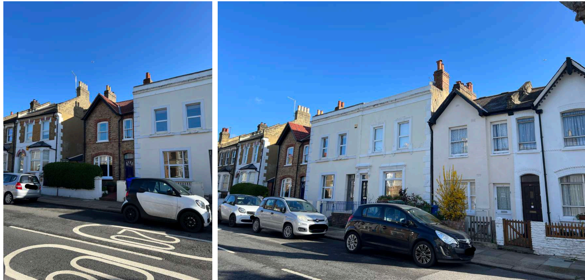
Existing front facade_35, 37, 39 & 41 in context