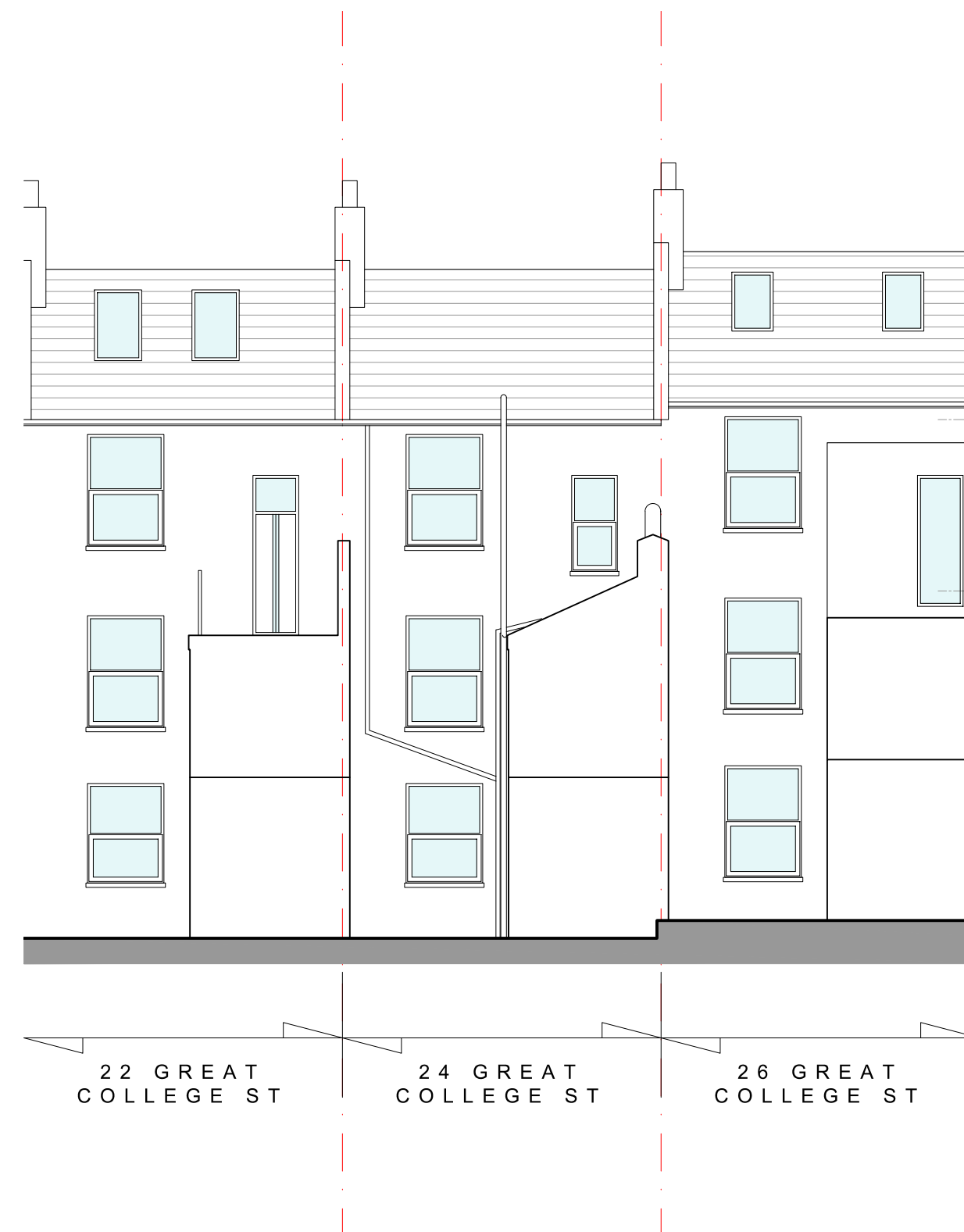
03 South Elevation Scale:1:100