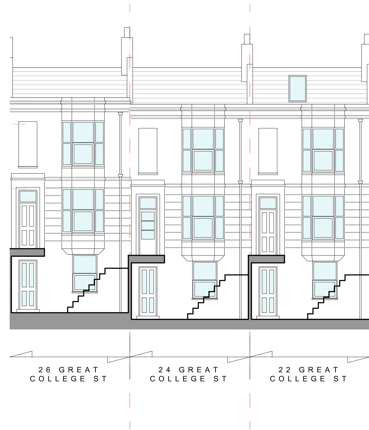
02 North Elevation Scale:1:100