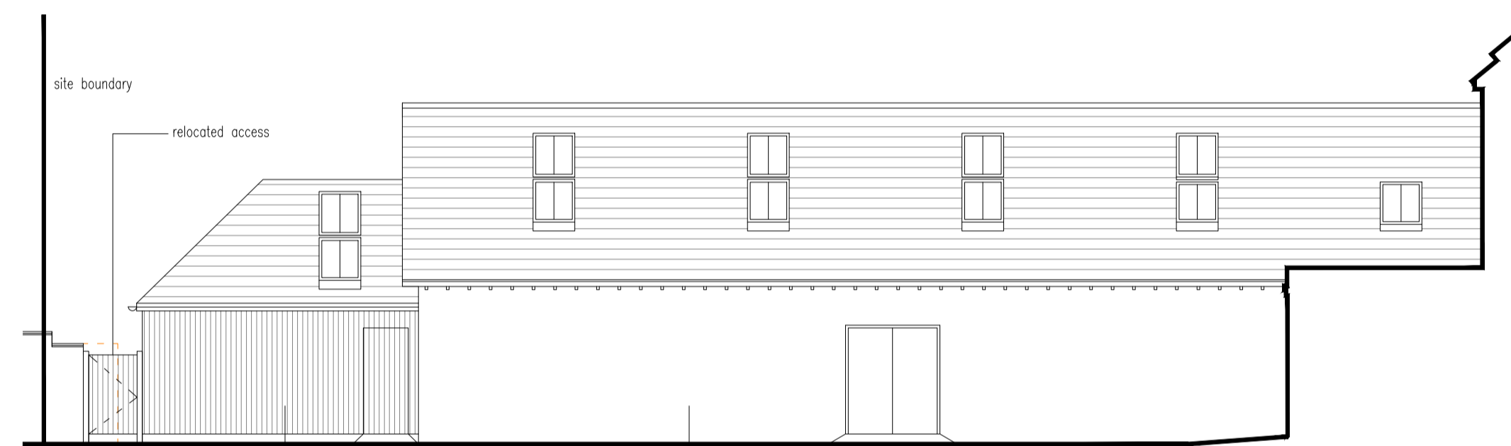
PROPOSED SIDE ELEVATION [EAST]