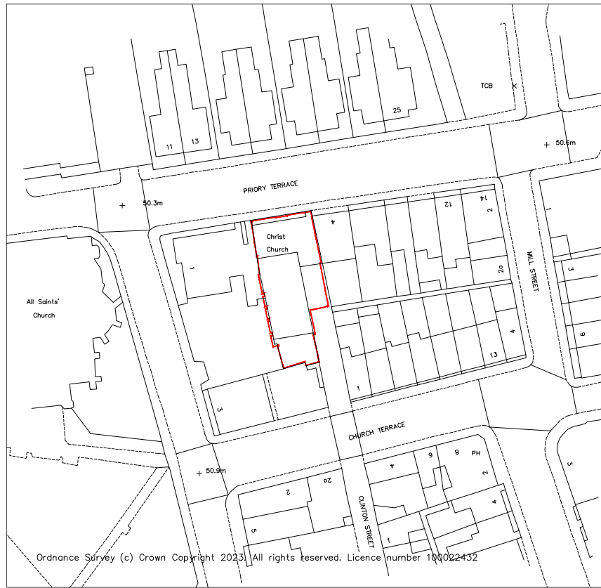
SITE LOCATION PLAN [1:1250]