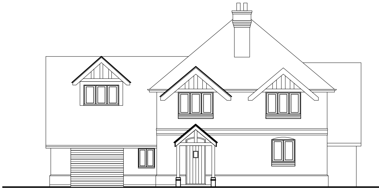
front elevation south - existing