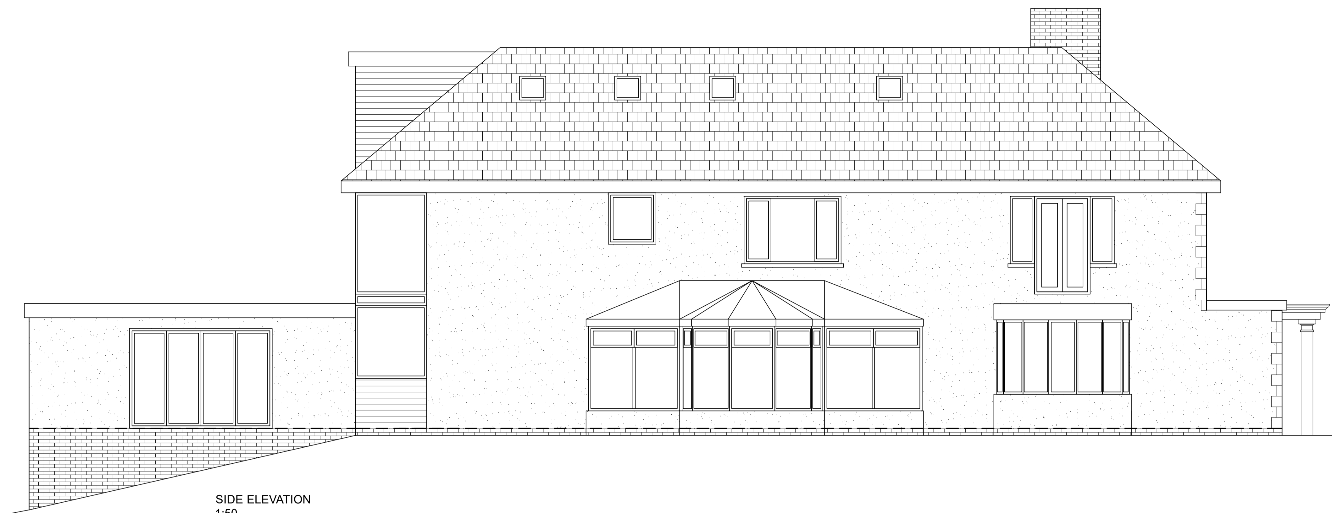
SIDE ELEVATION 1:50

This drawing to be read in conjunction with Structural Engineers drawings & calculations for all sub-structures, including below ground drainage & external works. Window / Door specialist drawings, M&E Consultant drawings & sub-contractors drawings & performance specifications for all specialist design elements. All works shall be carried out in strict accordance with the British Standards Codes of Practice relating to Workmanship and Materials, & current manufacturers details & instructions where appropriate.