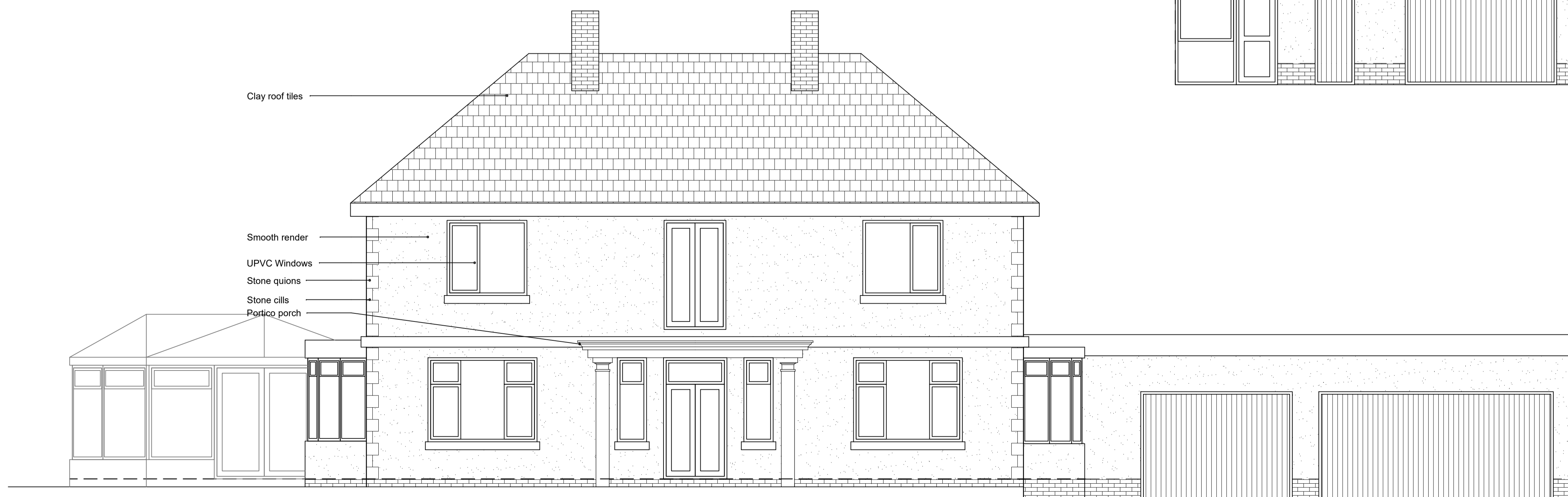
FRONT ELEVATION 1:50