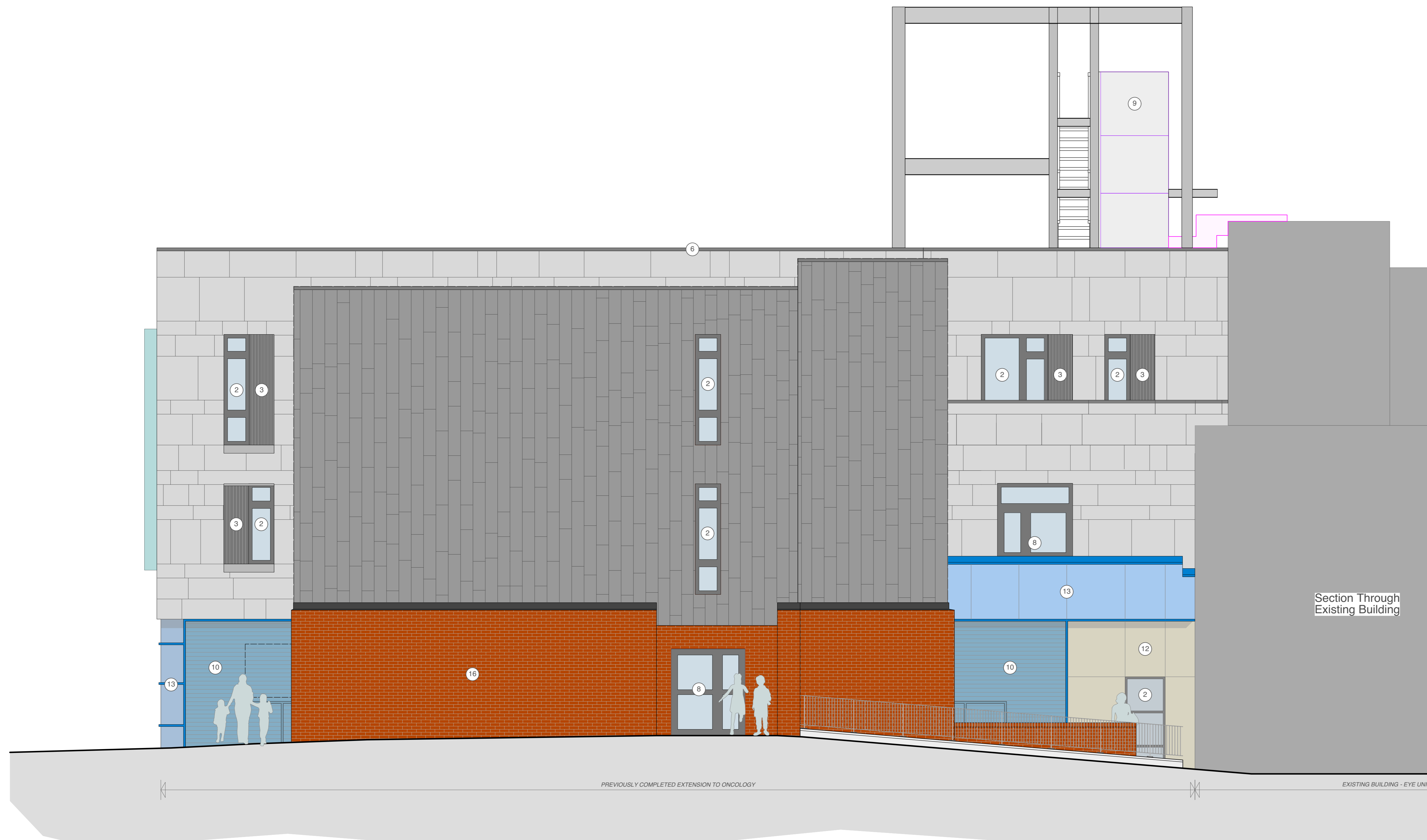
EXISTING SOUTH EAST ELEVATION 3