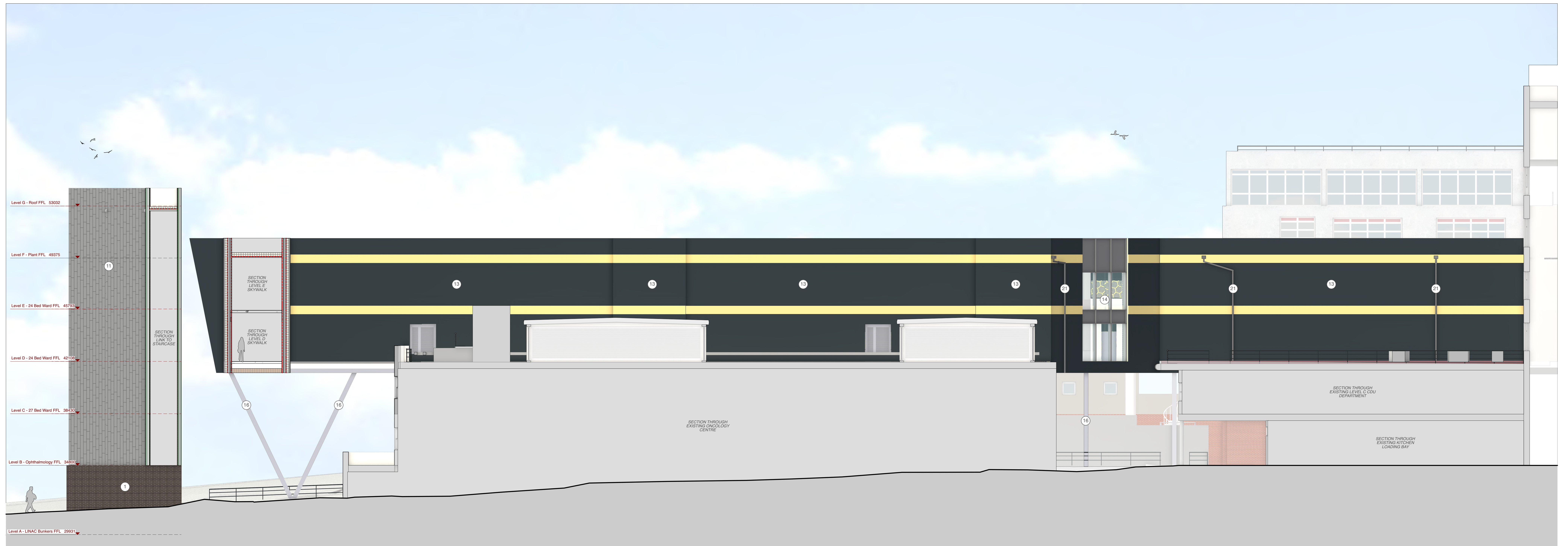
PROPOSED SOUTH EAST ELEVATION 5