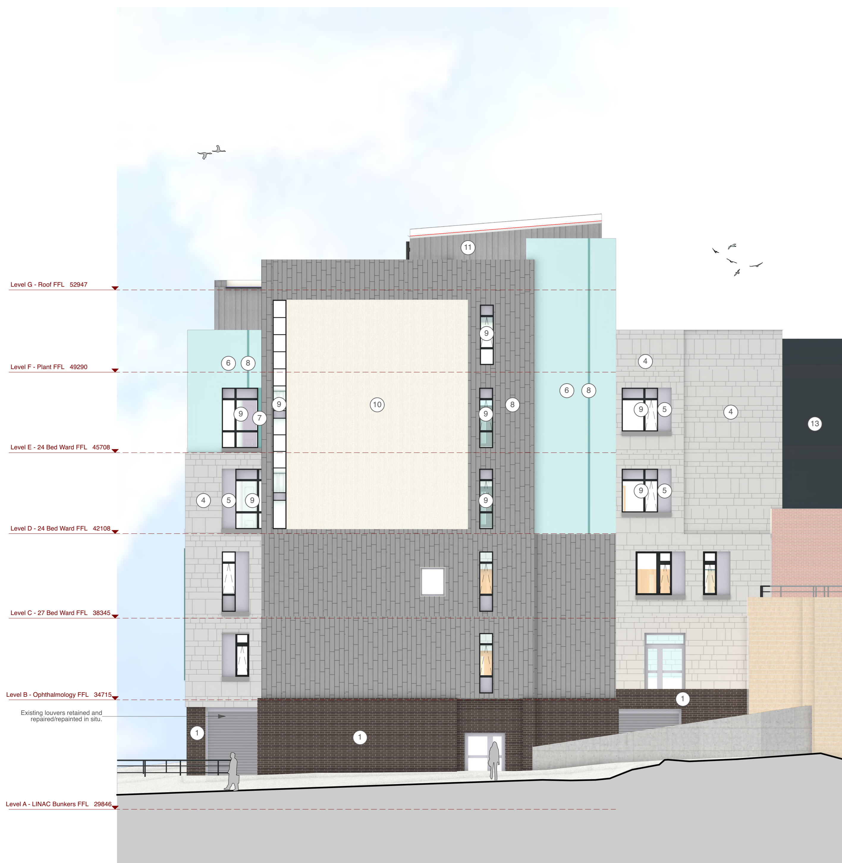
PROPOSED SOUTH EAST ELEVATION 2