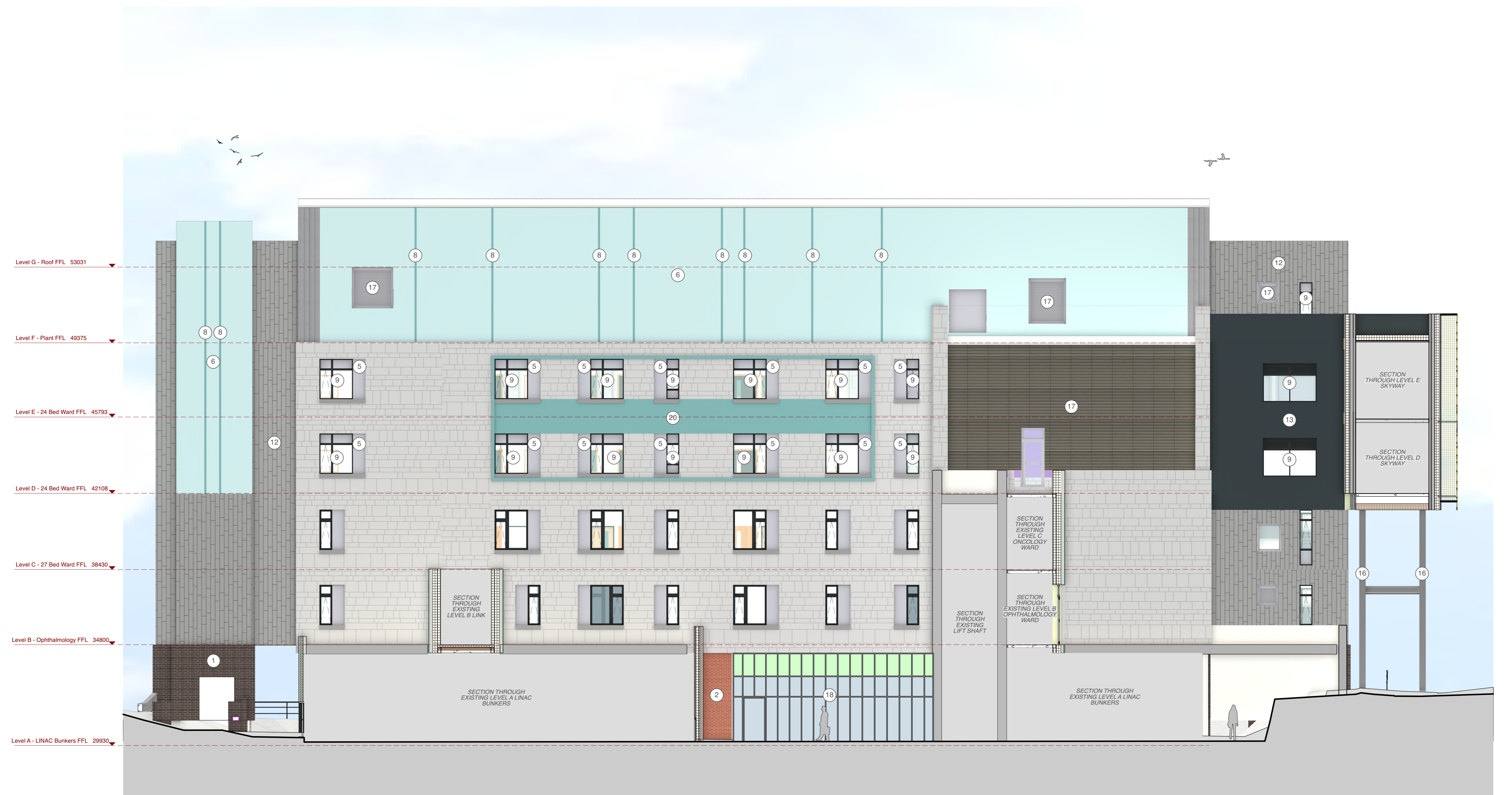
PROPOSED NORTH EAST ELEVATION 3