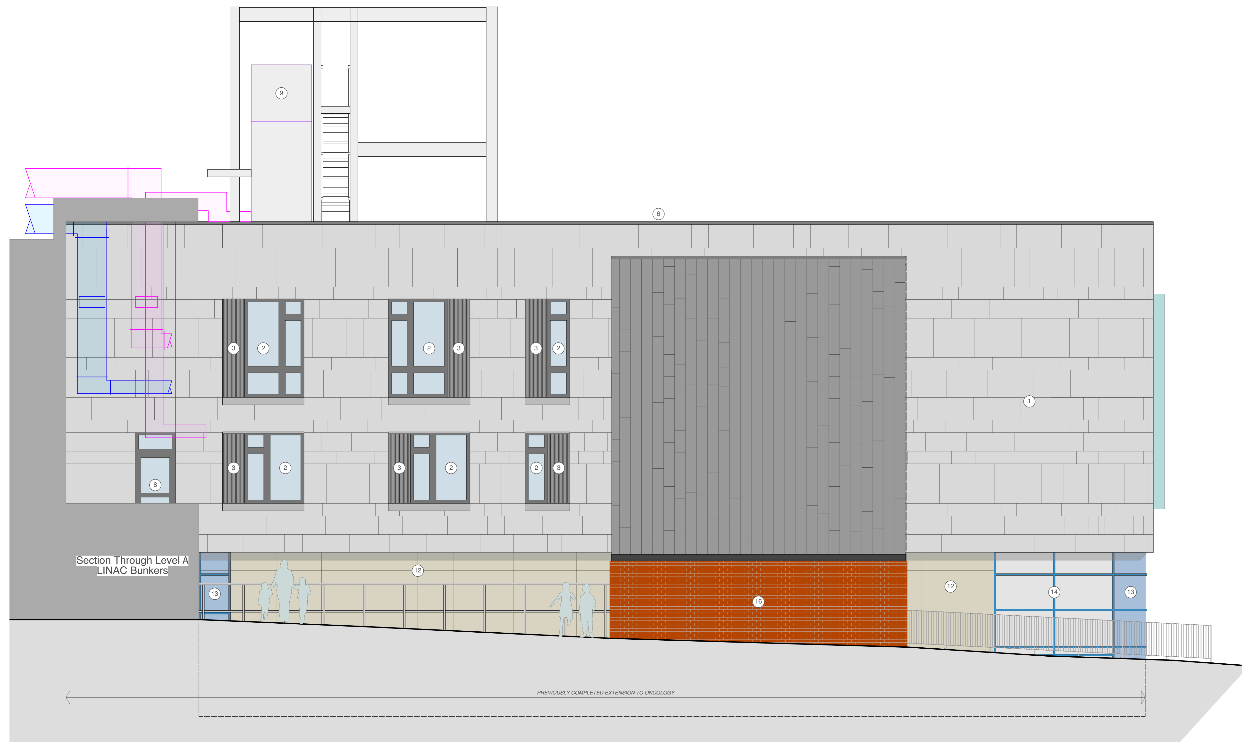
EXISTING NORTH WEST ELEVATION 1