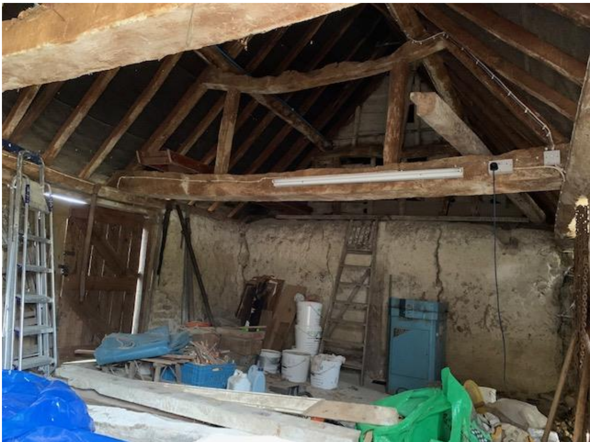
Number4 Main interior looking north west