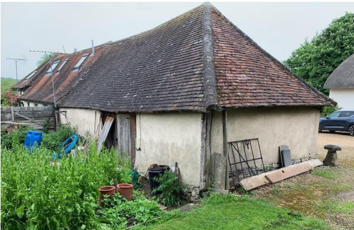
Number 2 South and west elevations, and part of adjoining Holymans Barn