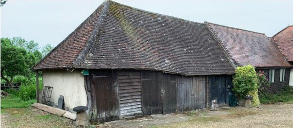
Number 1 East and south elevations, and part of adjoining Holymans Barn