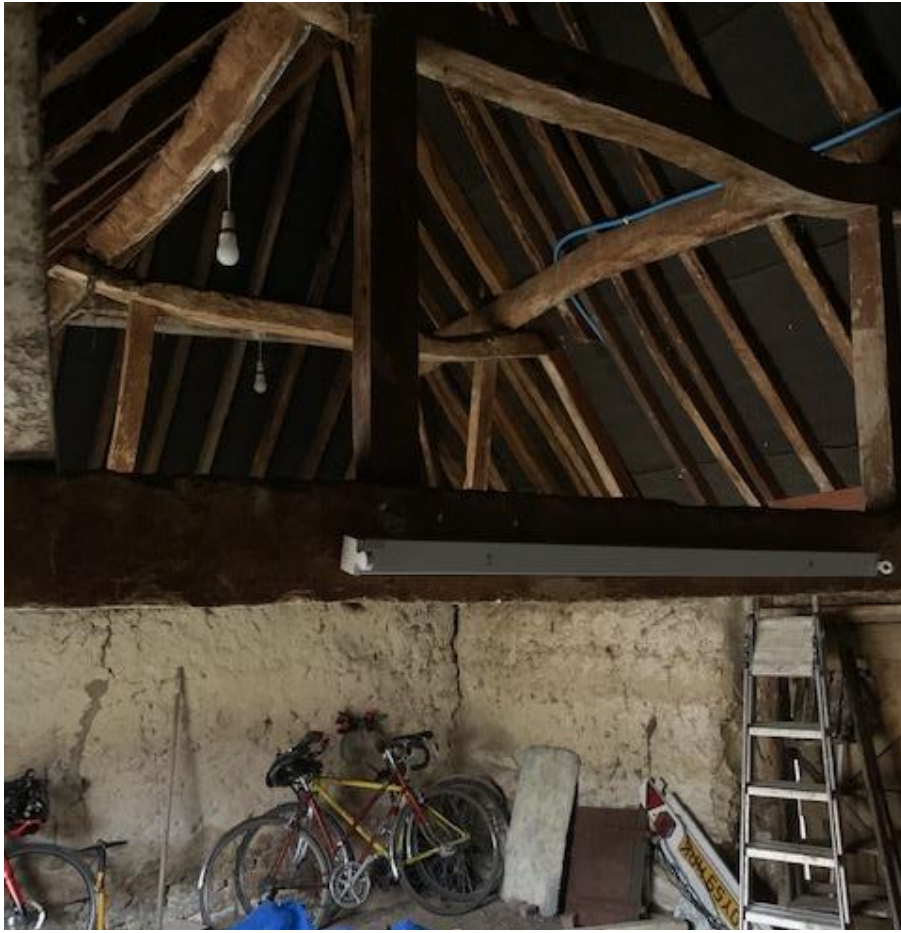
Number 5 Main interior looking south west