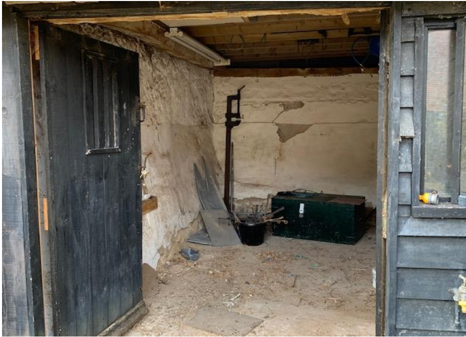
Number 3 Interior of northern most bay