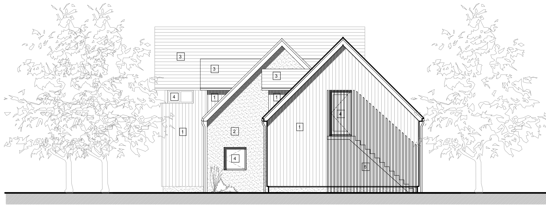
Side Elevation- B