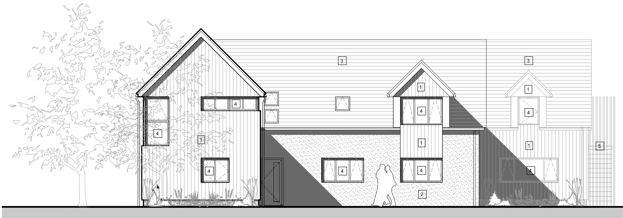
Front Elevation- A