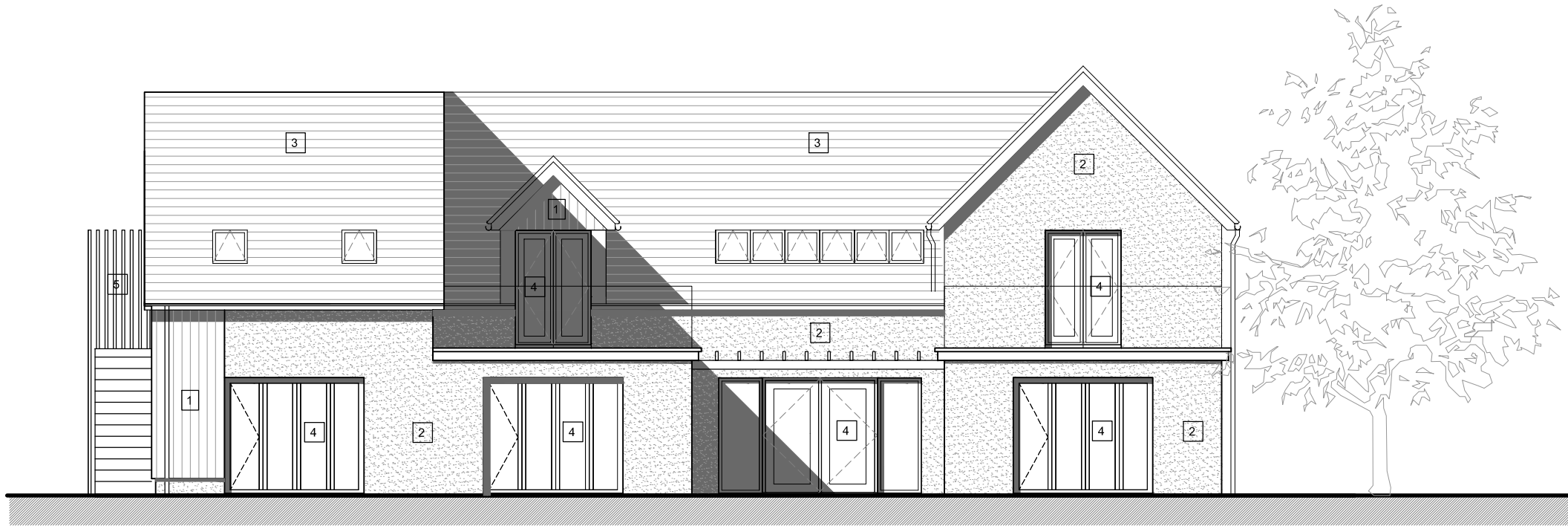
Rear Elevation- C