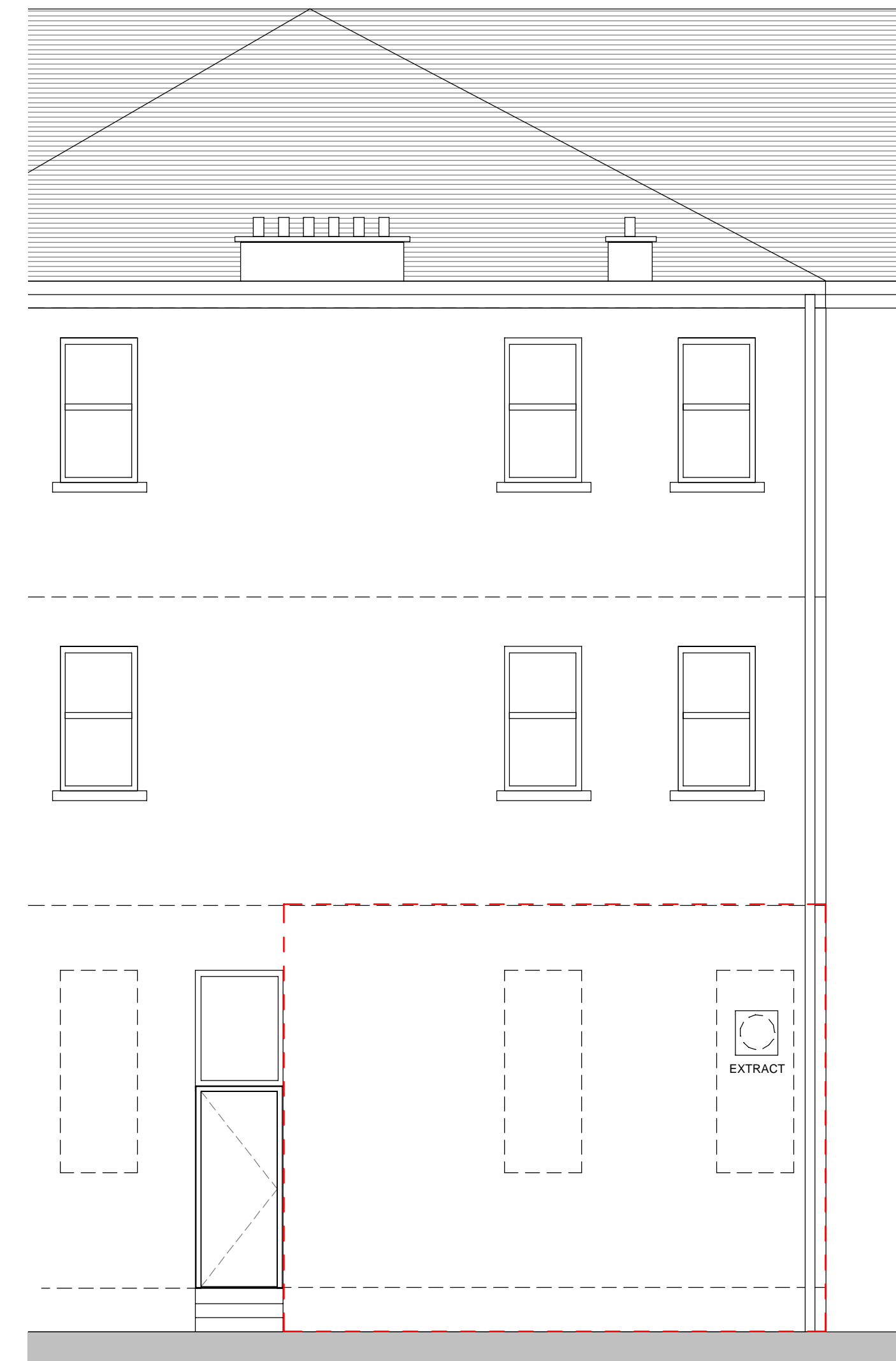
Proposed Rear Elevation 1 : 50