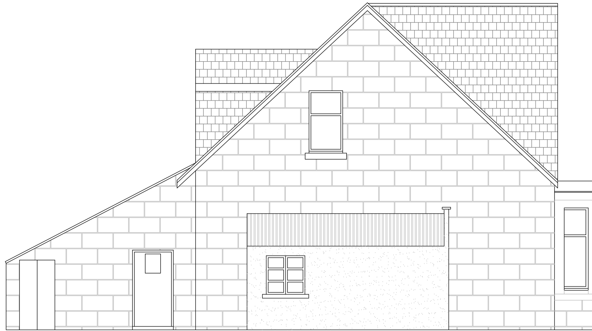
SIDE ELEVATION AS EXISTING

NOTES 1. This drawing is the sole copyright of Mark Alexander Brown Ltd and no part may be reproduced without the written consent from Mark Alexander Brown Ltd. 2. No dimensions are to be scaled from this drawing. Work to figured dimensions only. 3. Contractors must verify all figured dimensions on site before commencing any work or making any shop drawings. 4. All dimensions must be checked prior on site prior to commencement of works and any discrepancies notified immediately to Mark Alexander Brown Ltd.