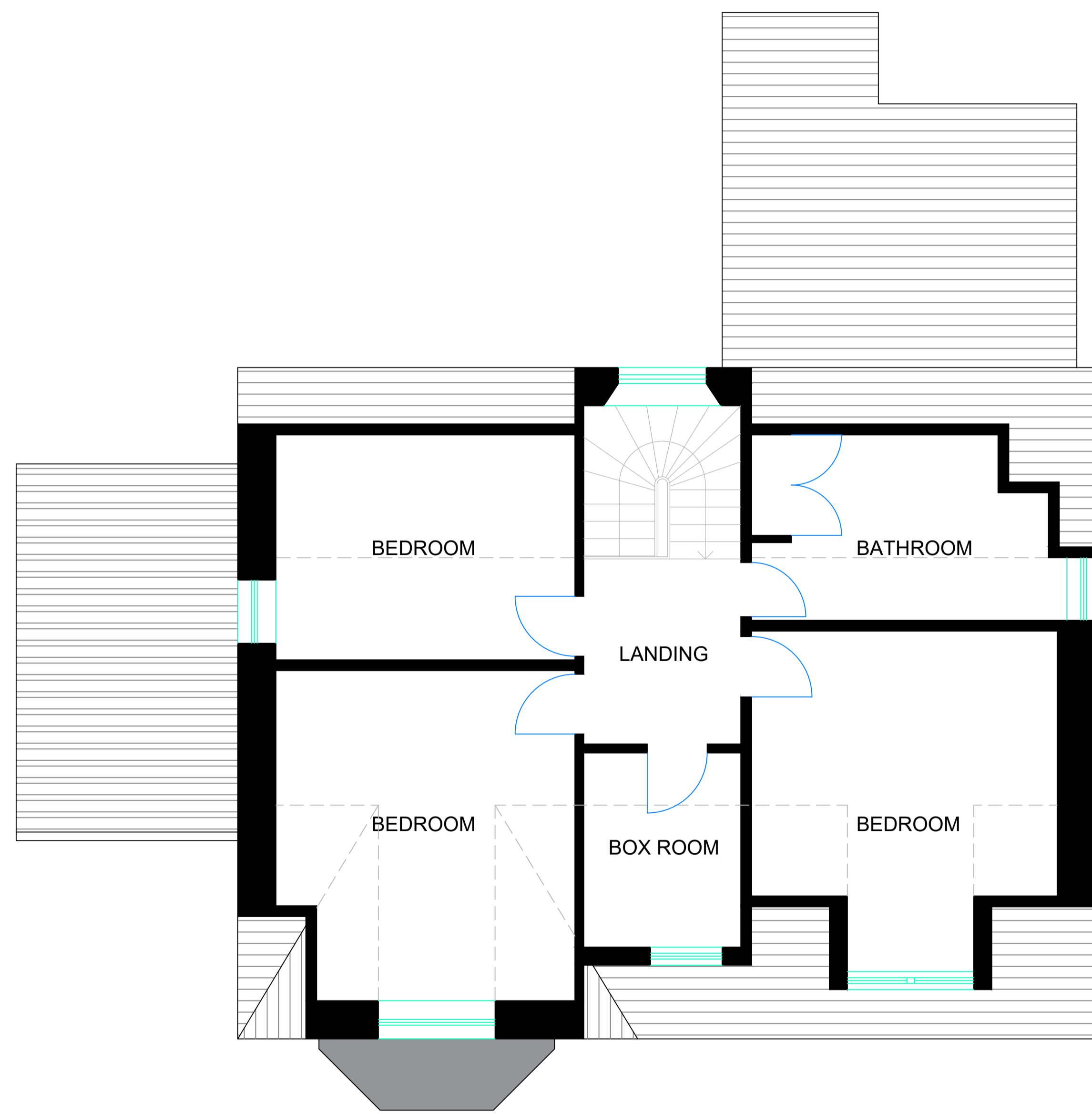
FIRST FLOOR AS EXISTING