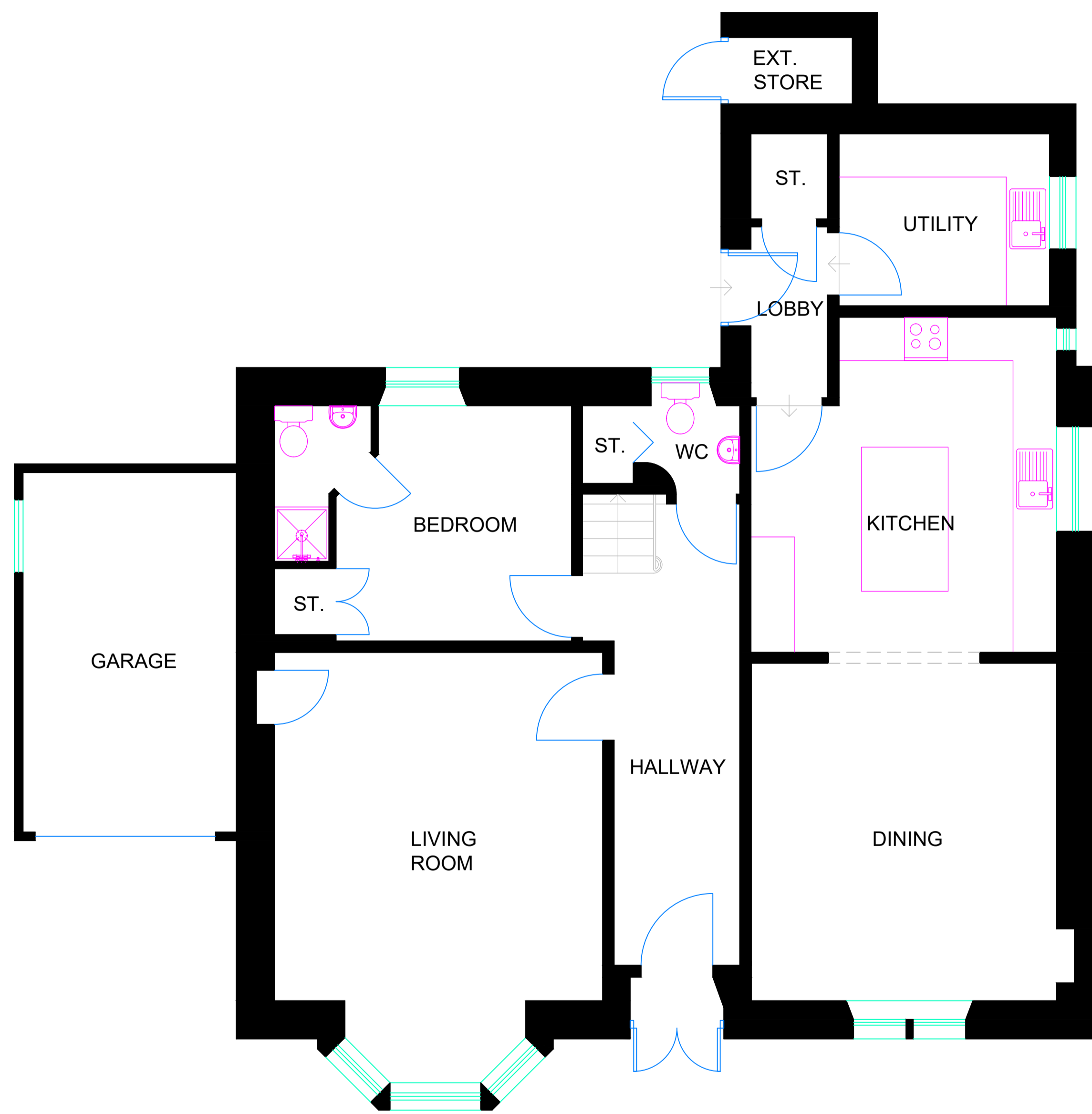
GROUND FLOOR AS EXISTING

NOTES 1. This drawing is the sole copyright of Mark Alexander Brown Ltd and no part may be reproduced without the written consent from Mark Alexander Brown Ltd. 2. No dimensions are to be scaled from this drawing. Work to figured dimensions only. 3. Contractors must verify all figured dimensions on site before commencing any work or making any shop drawings. 4. All dimensions must be checked prior on site prior to commencement of works and any discrepancies notified immediately to Mark Alexander Brown Ltd.