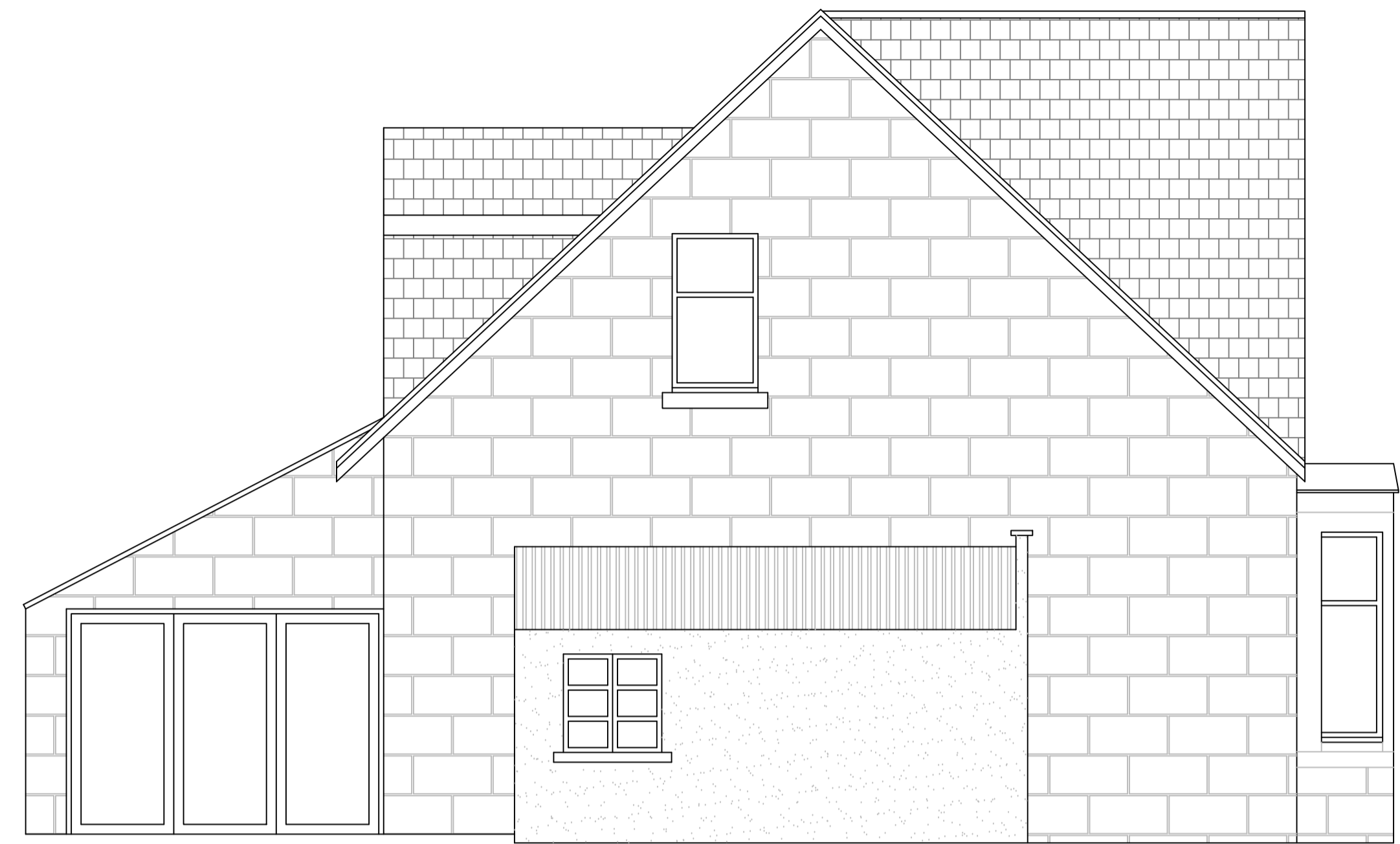
SIDE ELEVATION AS PROPOSED

NOTES 1. This drawing is the sole copyright of Mark Alexander Brown Ltd and no part may be reproduced without the written consent from Mark Alexander Brown Ltd. 2. No dimensions are to be scaled from this drawing. Work to figured dimensions only. 3. Contractors must verify all figured dimensions on site before commencing any work or making any shop drawings. 4. All dimensions must be checked prior on site prior to commencement of works and any discrepancies notified immediately to Mark Alexander Brown Ltd.