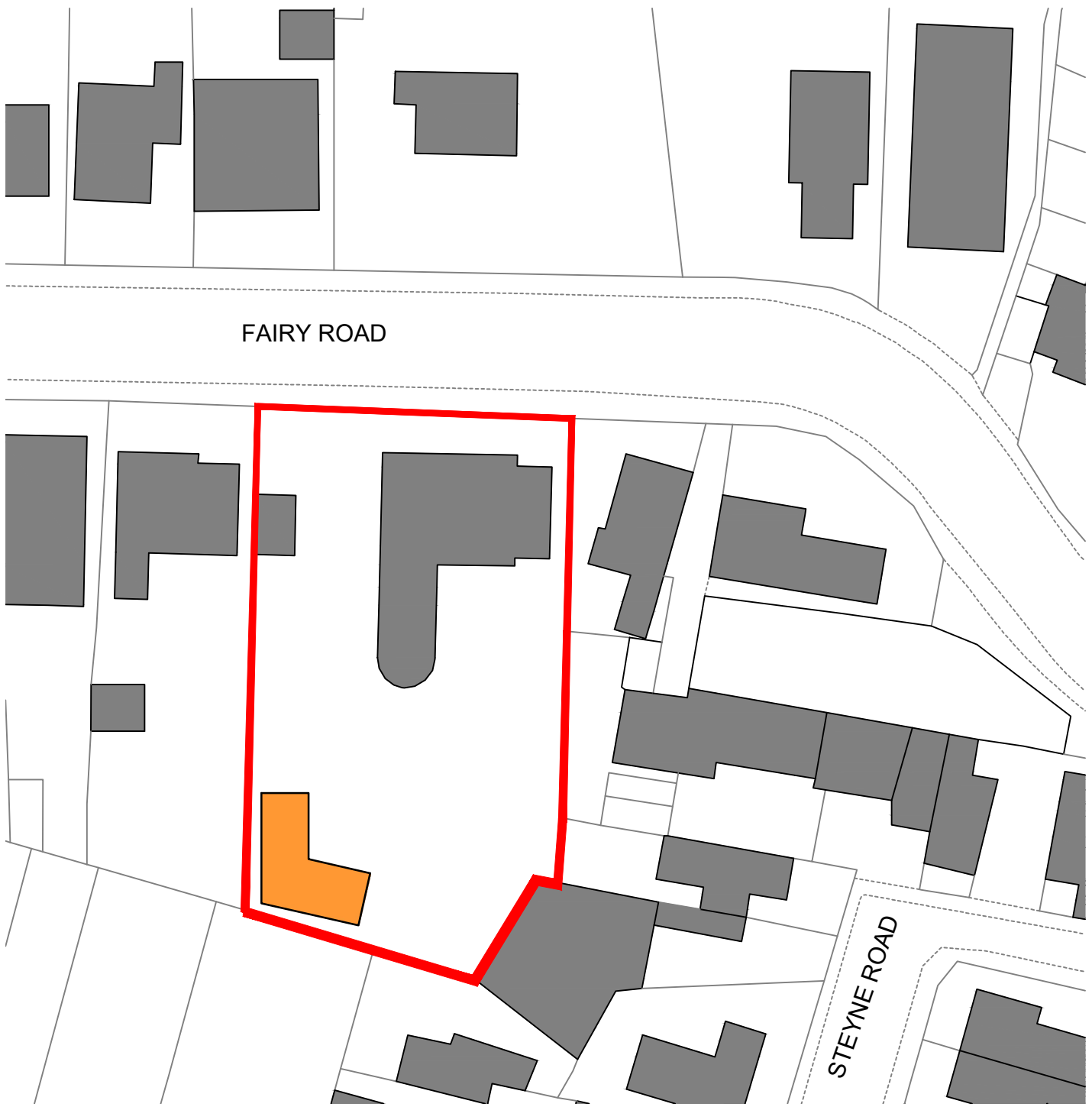
PROPOSED SITE LOCATION PLAN SCALE 1:500 @ A3