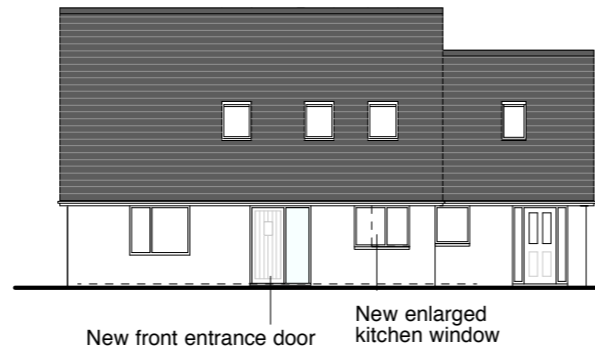
New front entrance door New enlarged kitchen window