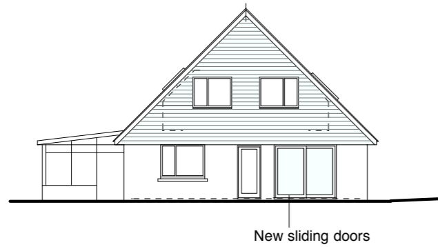
New sliding doors

HEALTH AND SAFETY Contractor to refer to the requirements of the CDM (2015) Regulations with respect to the Construction Phase Plan and HSE Notification. Clients, Designers and Builders all have duties under the Regulations.