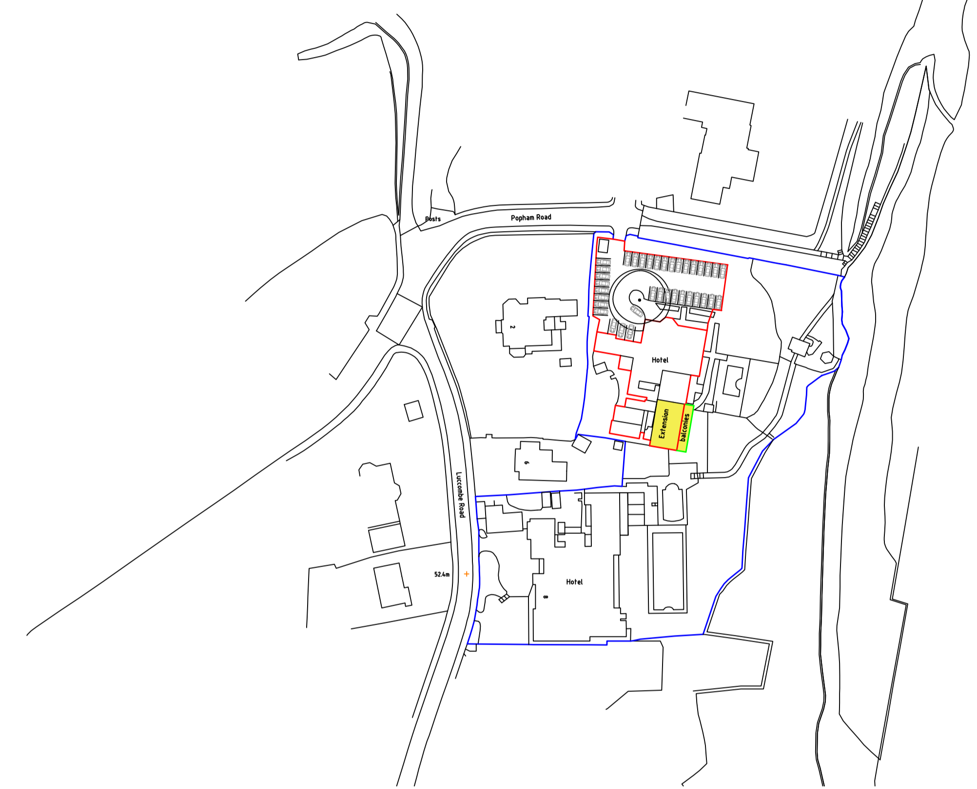
Proposed Location Plan Scale 1:1250@ A1