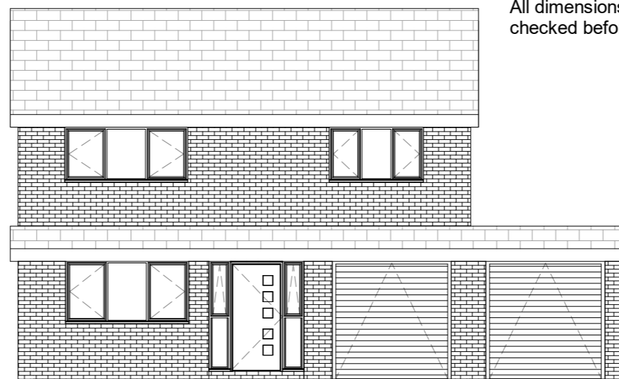
2 Front 1 : 100

All dimensions and levels on site to be checked before work commences.