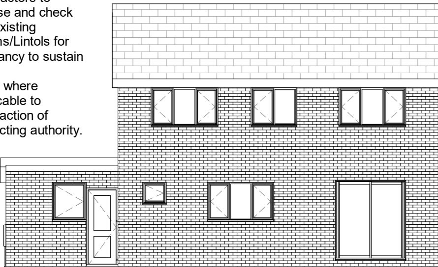
4 Rear 1 : 100

Contractors to expose and check any existing Beams/Lintols for adeqancy to sustain new loads where applicable to satisfaction of inspecting authority.