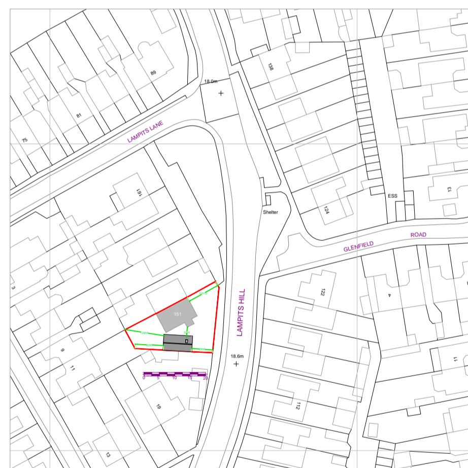
EXISTING Location Plan - 1:1250