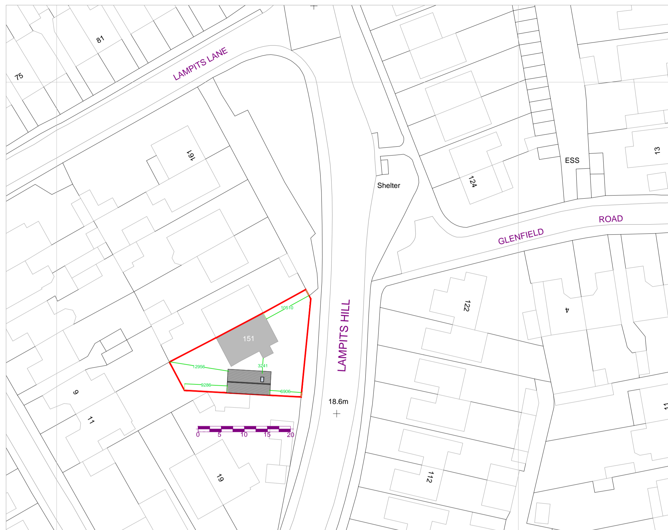
EXISTING Block Plan - 1:500