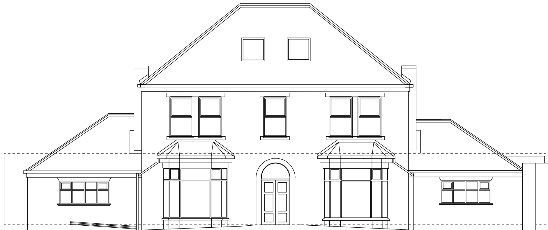
Front Elevation From Carpark (Durham Road) South East view