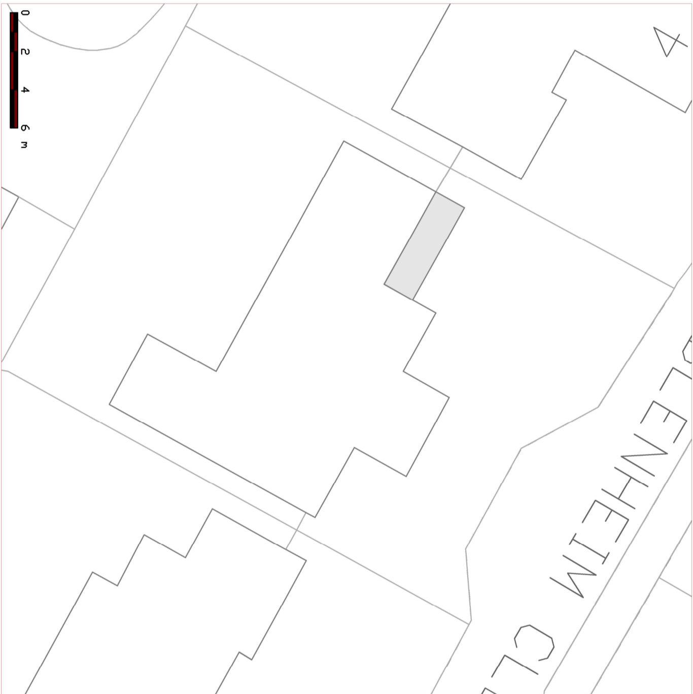
SITE PLAN - PROPOSED EXTENSION SHADED AREA SCALE 1 : 200