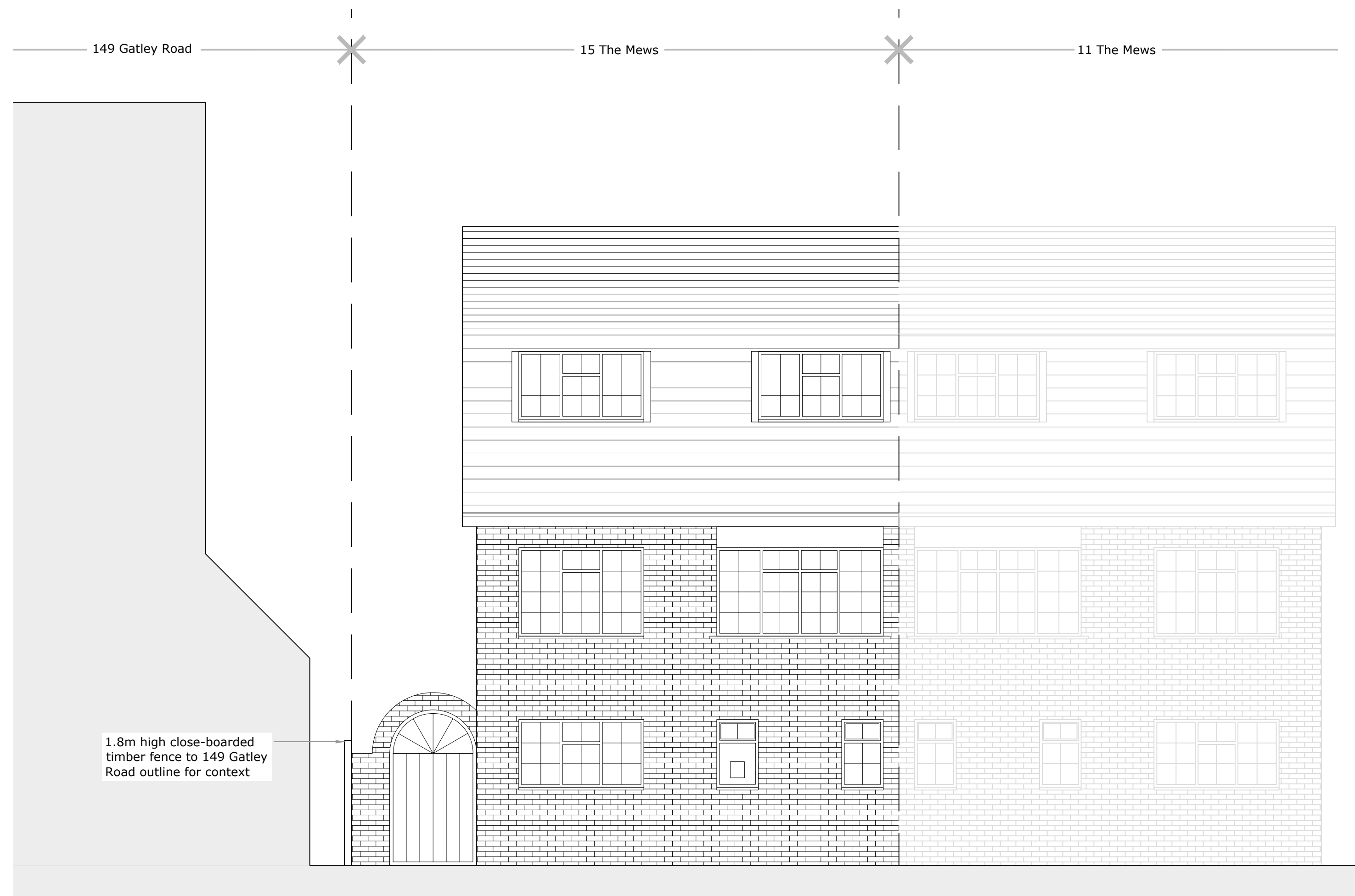
rear elevation (north facing) as existing 1:50