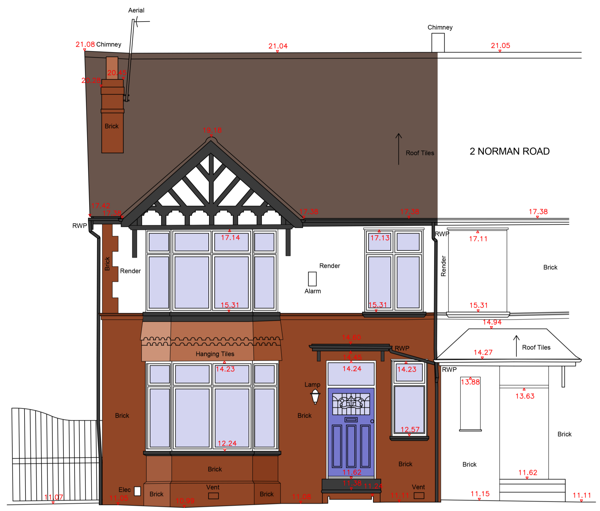
East Elevation - to Norman Road

THIS DRAWING IS FOR PLANNING APPLICATION PURPOSES ONLY