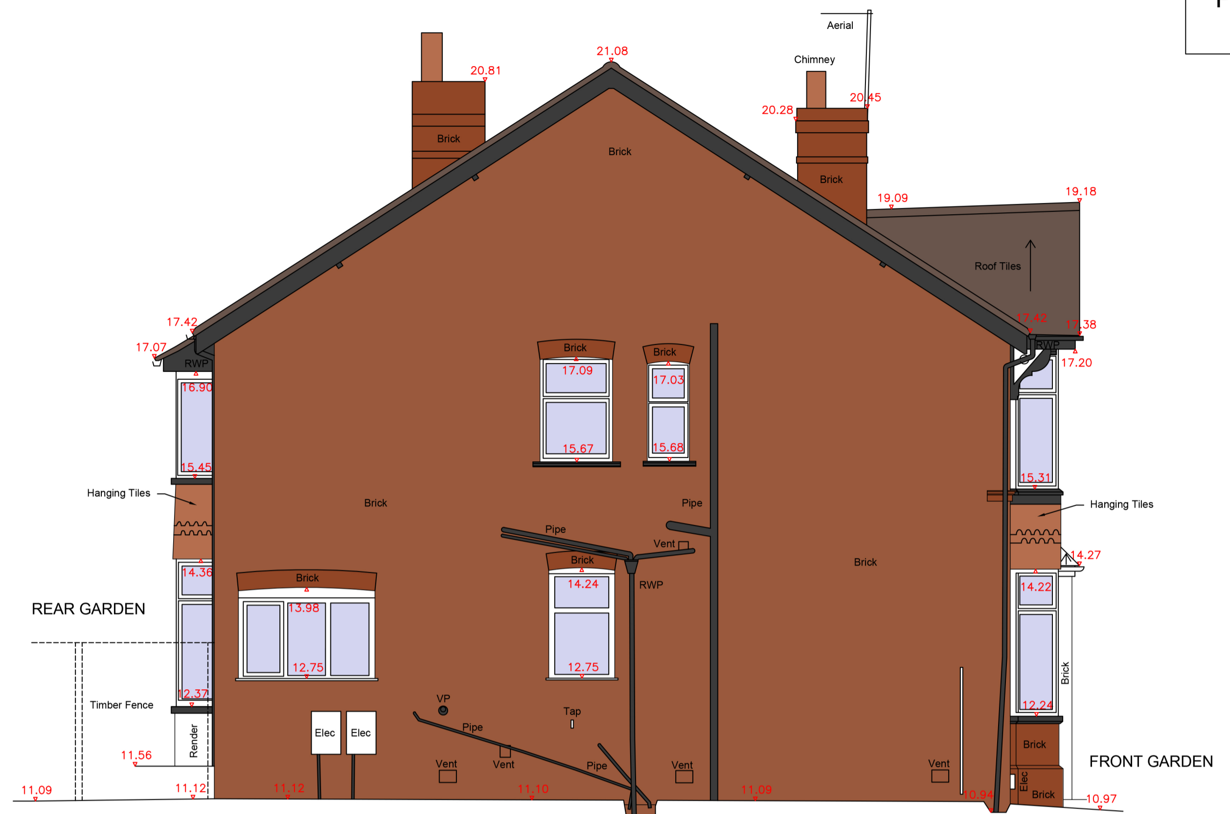
South Elevation - to No. 6 Norman Road