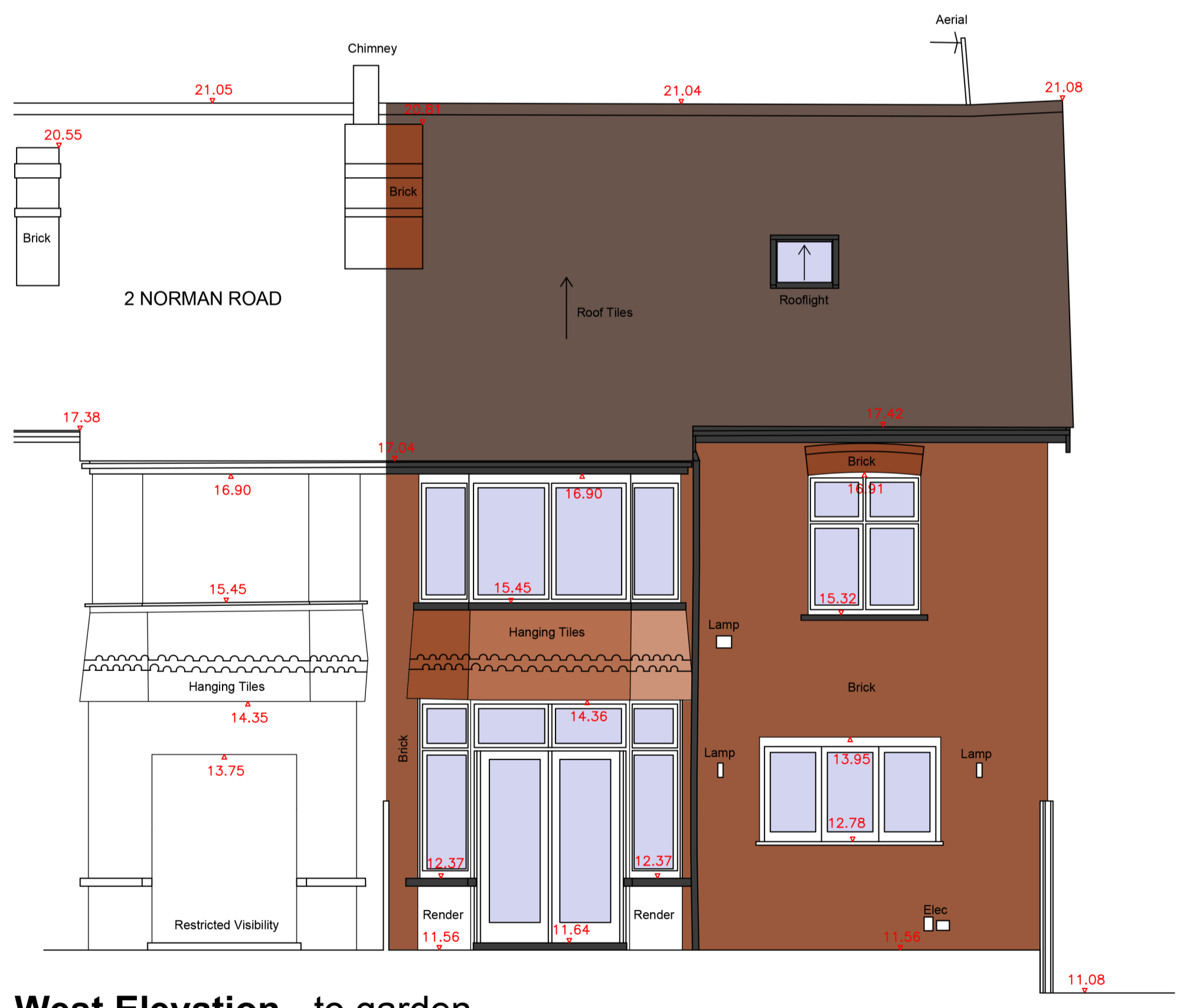
West Elevation - to garden