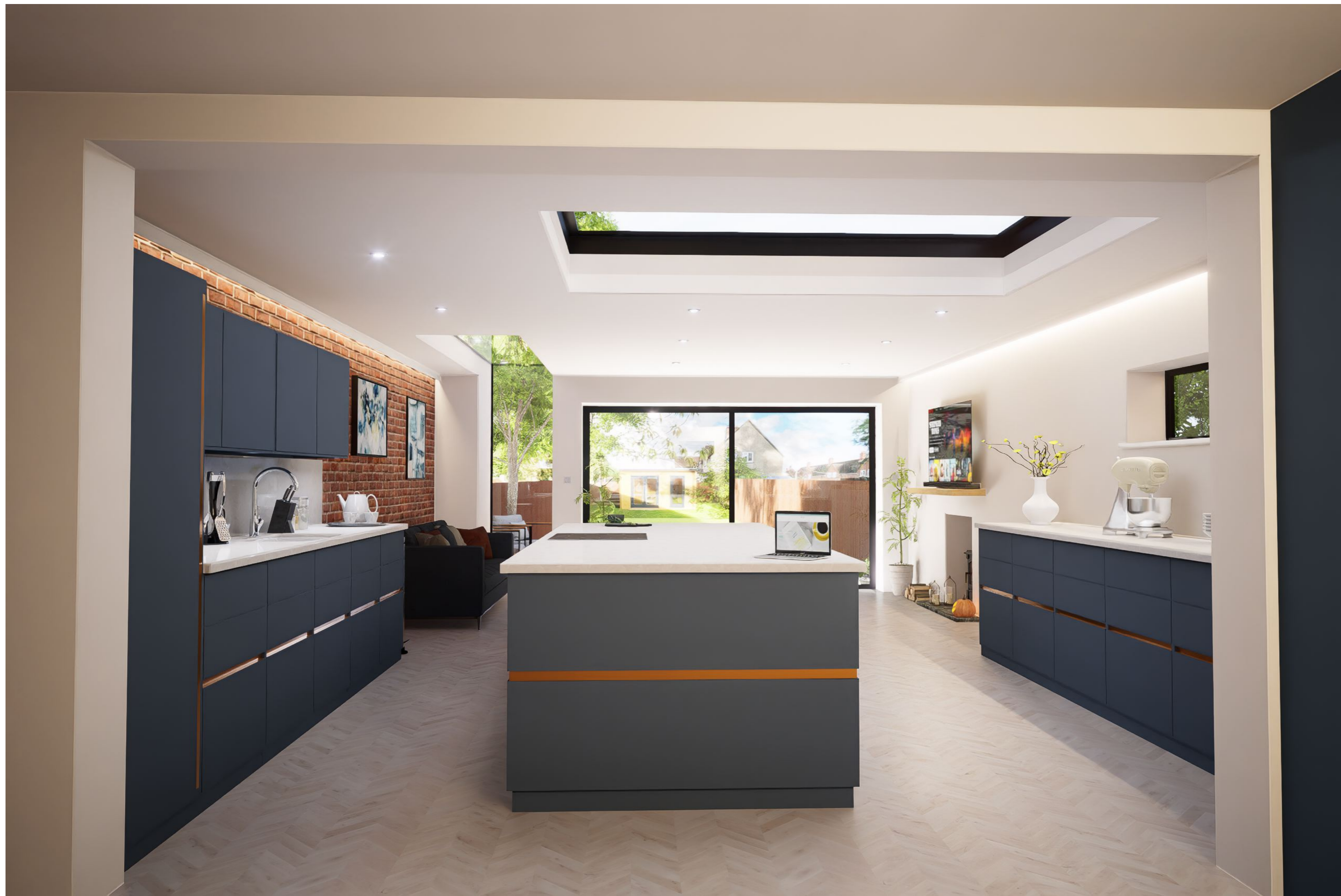
CGI 04 CGI OF INTERIOR KITCHEN/DINING ILLUSTRATION PURPOSES ONLY