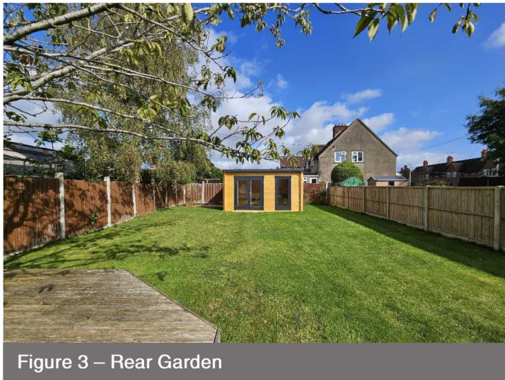
Figure 3 – Rear Garden