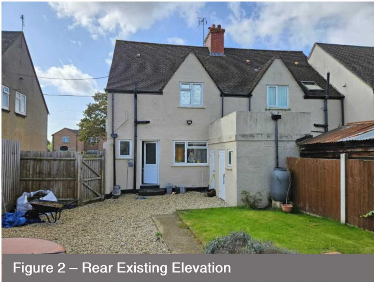
Figure 2 – Rear Existing Elevation