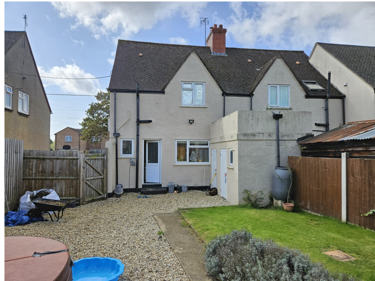
06 EXISTING REAR PHOTOGRAPH 06 SCALE 1:50 @A2