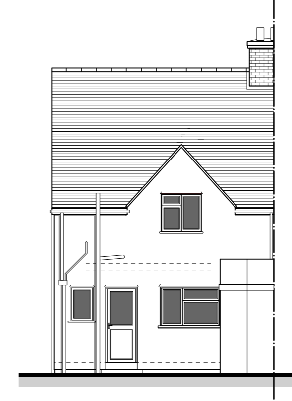
05 EXISTING REAR ELEVATION 06 SCALE 1:50 @A2