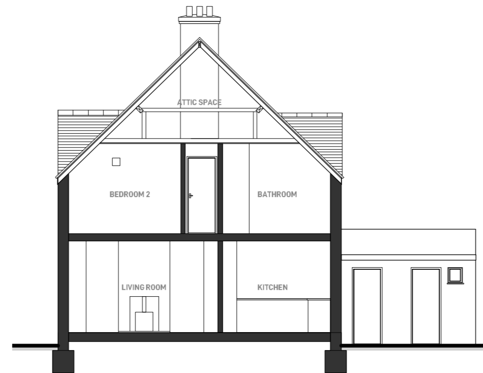
02 EXISTING SECTION AA 06 SCALE 1:50 @A2