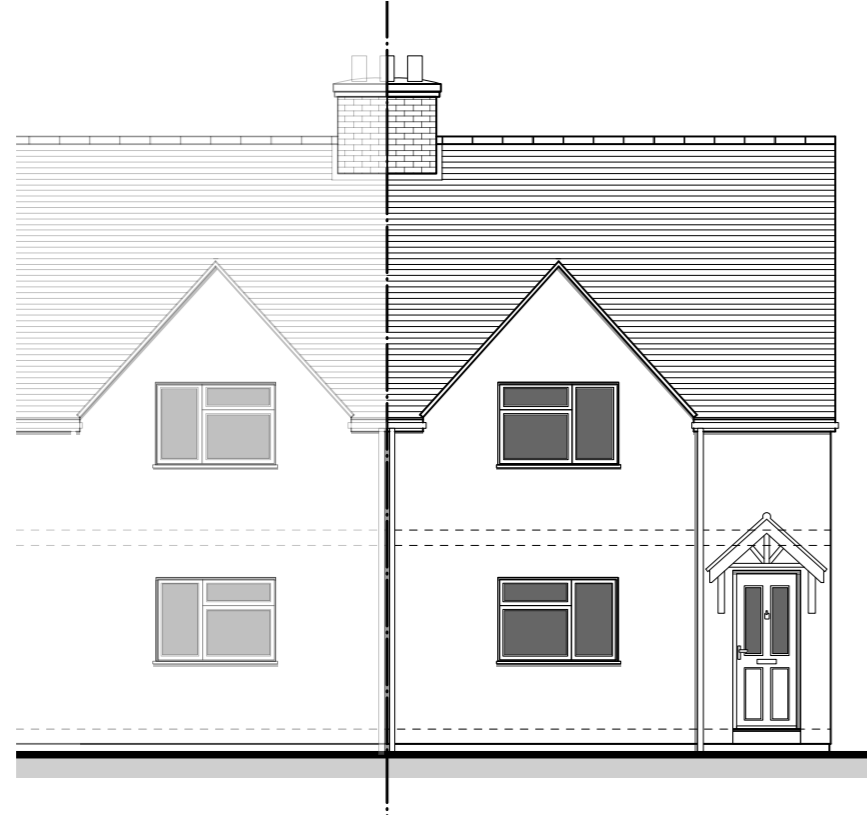
01 EXISTING FRONT ELEVATION 06 SCALE 1:50 @A2