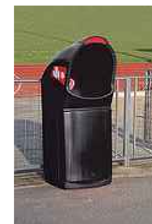
External Bin QUANTITY TO BE CONFIRMED AT PRE-CON

© copyright 2023 This drawing and the copyrights and patents therein are the designer's property and may not be used or reproduced - only under contract.