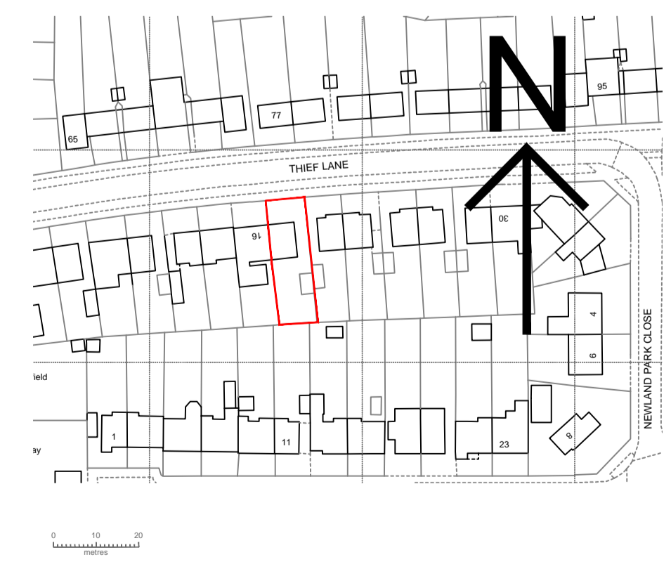
SITE LOCATION PLAN SCALE 1:1250 @ A1