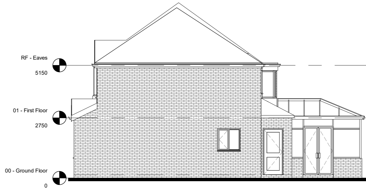
2 BB - Existing Side Elevation 1 1 : 100