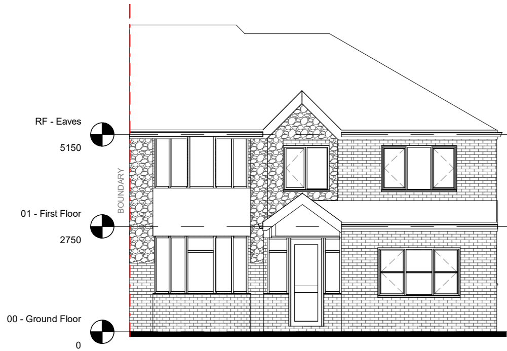
1 AA - Existing Front Elevation 1 : 100

NOTES Drawing copyright check all dimensions on site