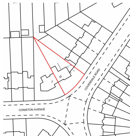
1 Location Plan SS 1 : 1250