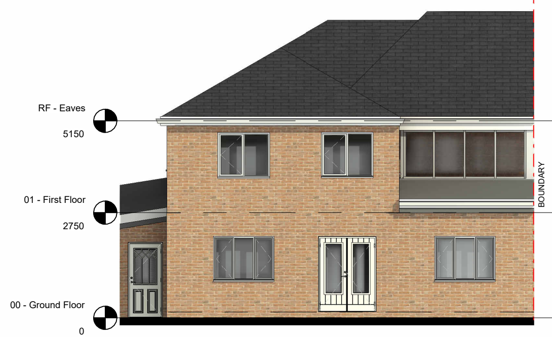
3 CC - Proposed Rear Elevation SS 1 : 100