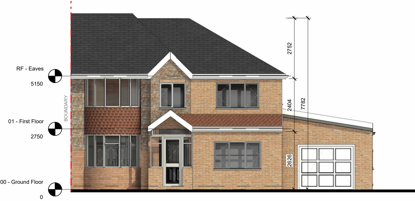
1 AA - Proposed Front Elevation SS 1 : 100

NOTES Drawing copyright check all dimensions on site