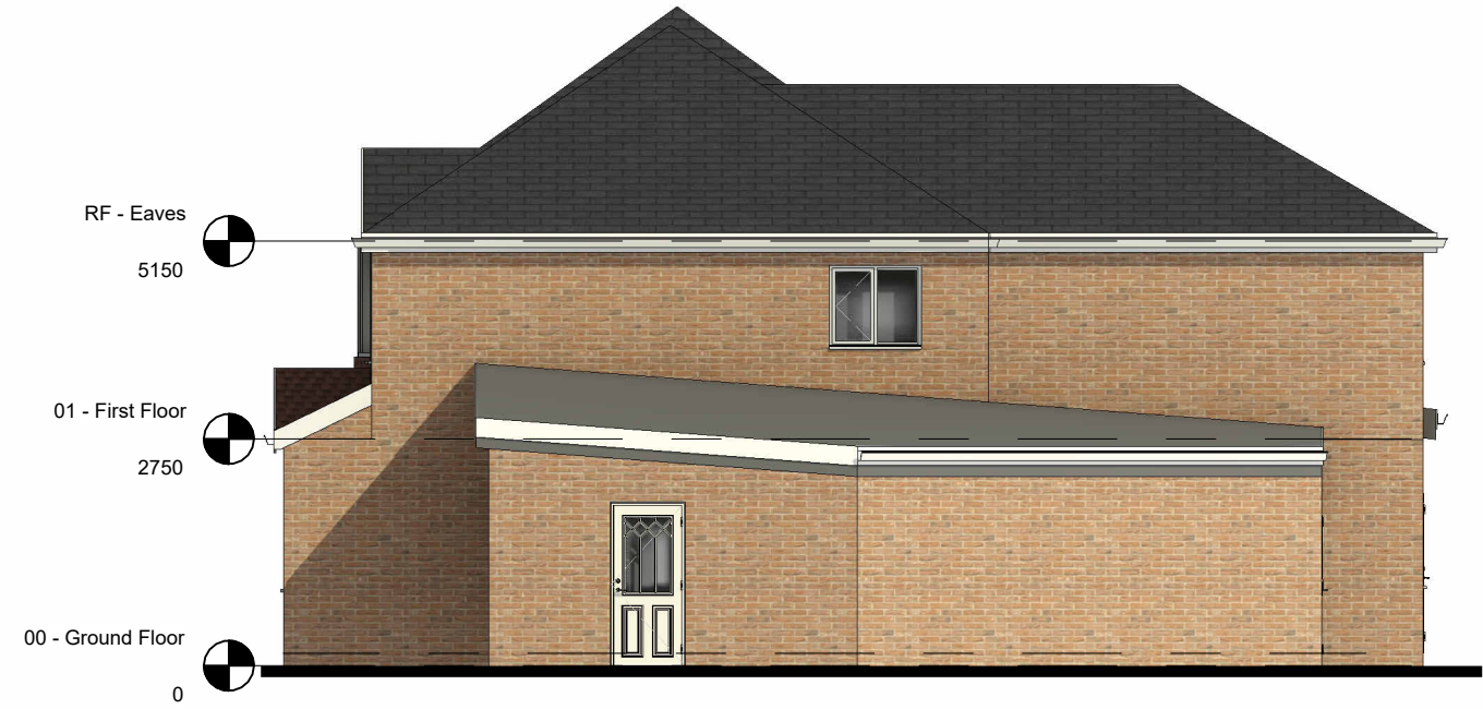
2 BB - Proposed Side Elevation 1 SS 1 : 100