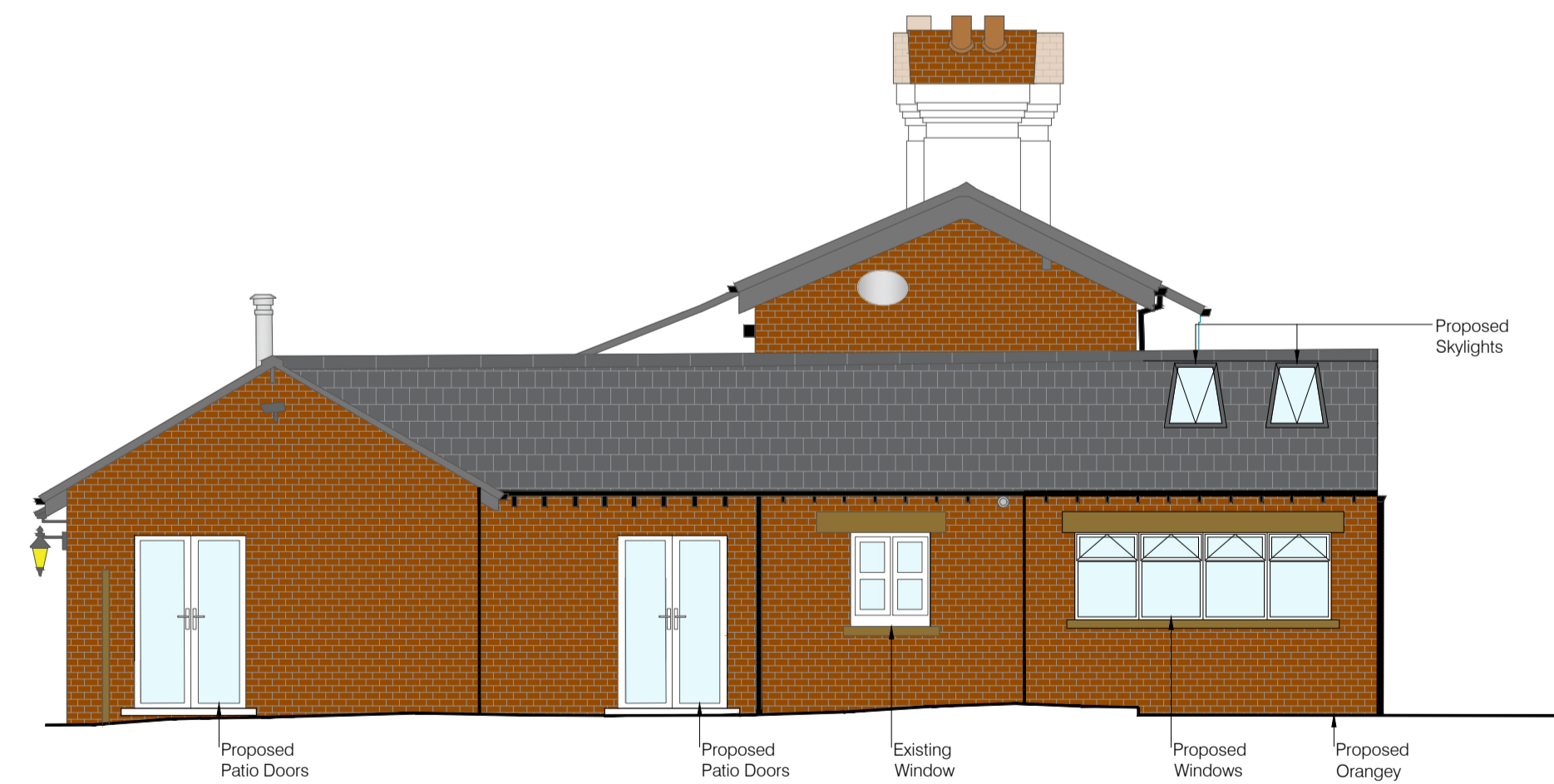
Proposed Right Elevation