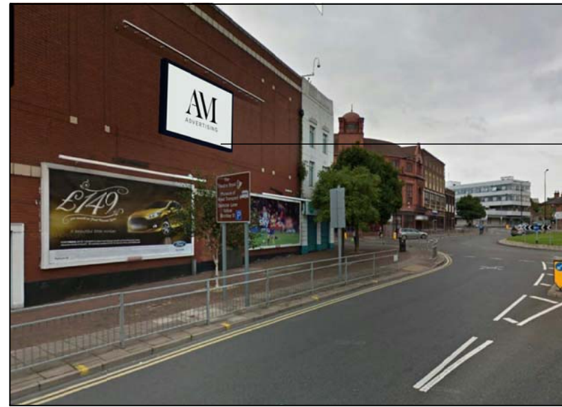
IMAGE AS PROPOSED