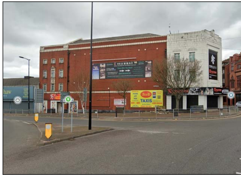
IMAGE AS EXISTING