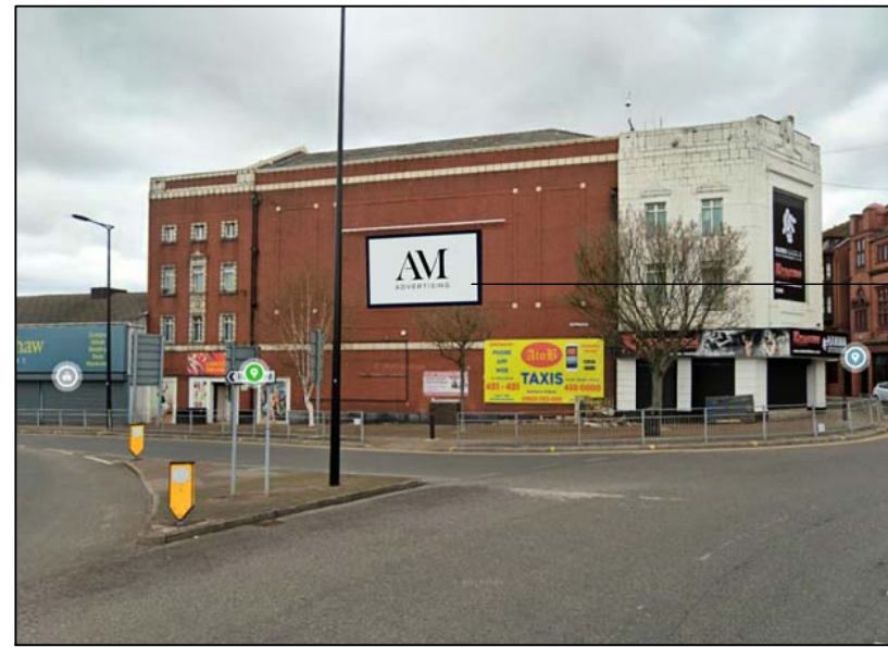
IMAGE AS PROPOSED