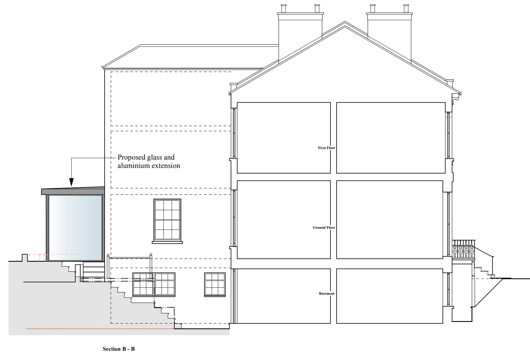
Section B - B