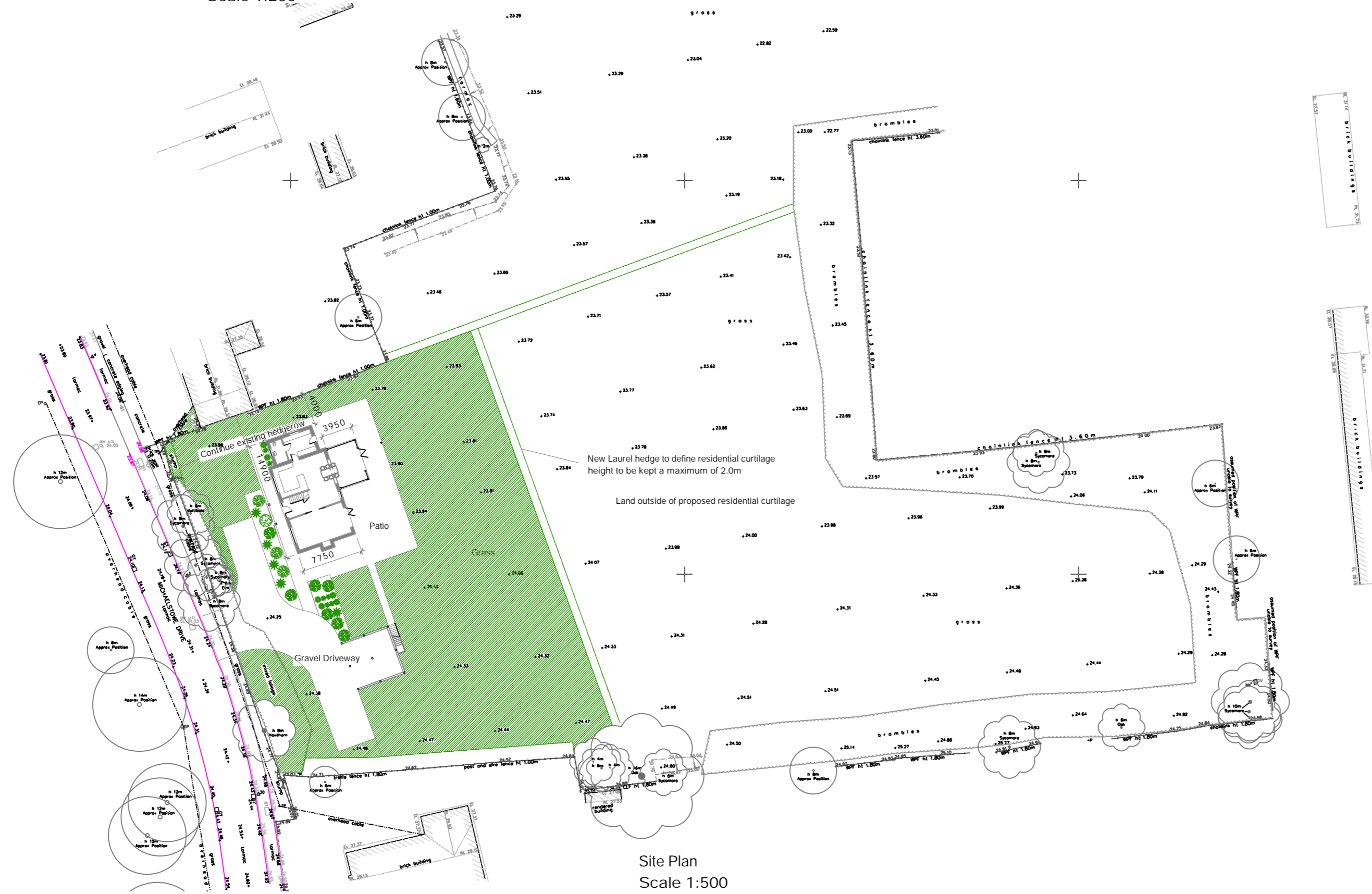
Site Plan Scale 1:500

Proposed Ridge 32.18 Proposed Ridge (Carport) 30.35 Proposed Eaves (House) 27.80 Proposed Eaves (Carport) 26.72 Proposed FFL (House) 24.15