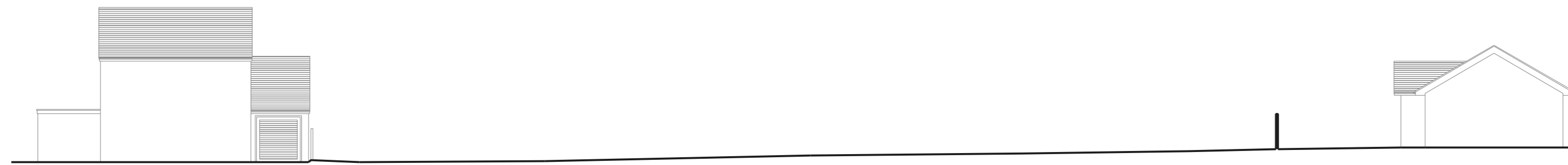
Existing Street Scene Scale 1:200