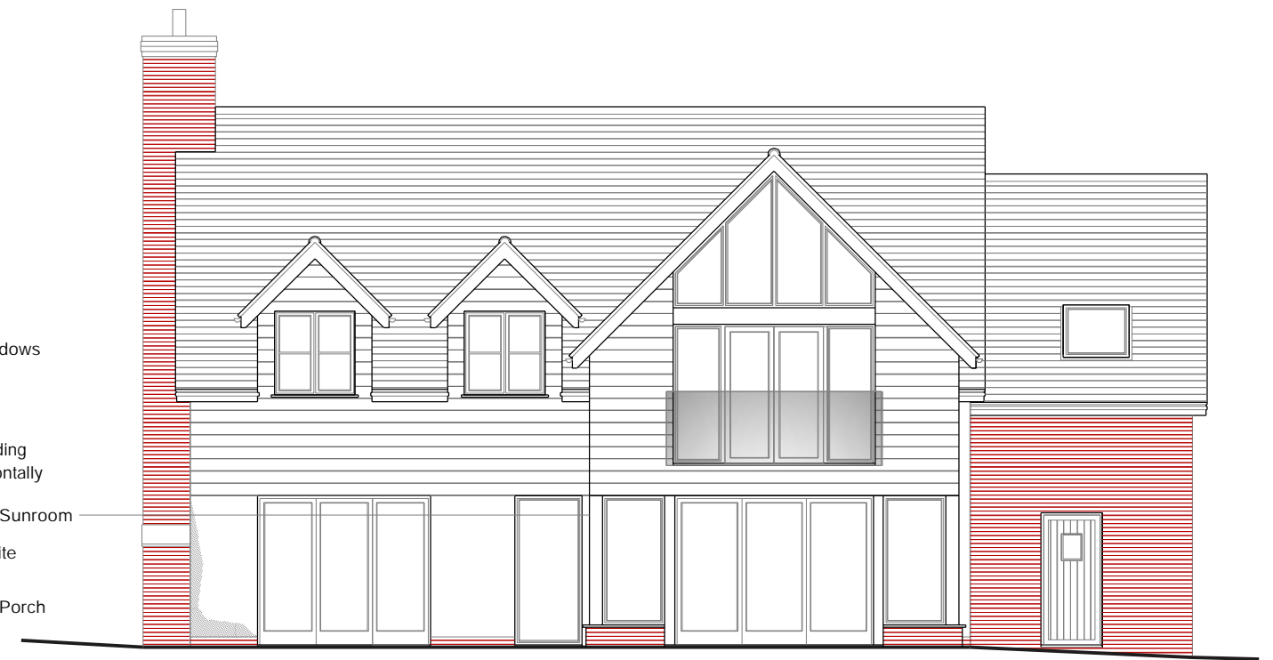
East Elevation Scale 1:100