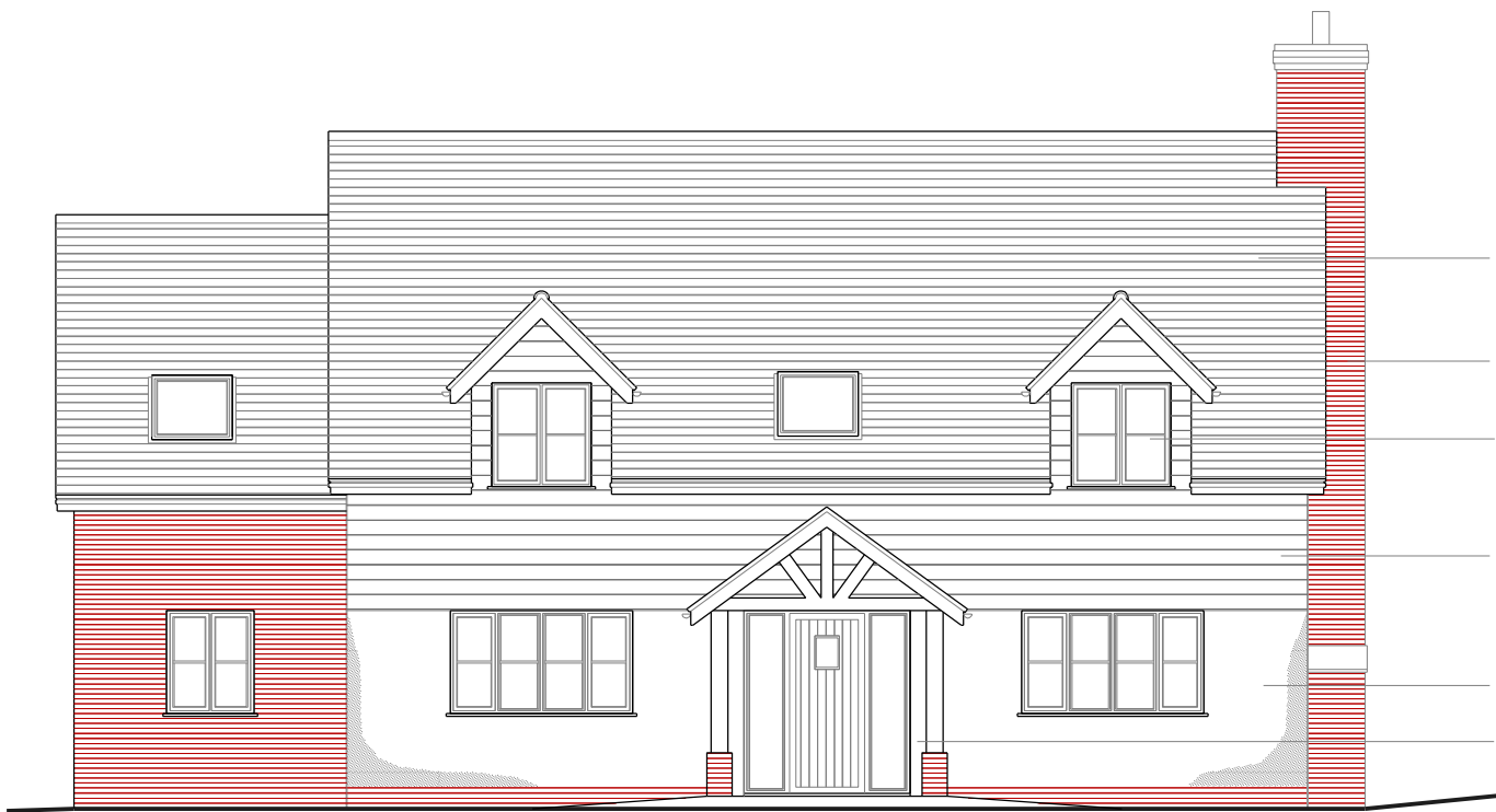
West Elevation Scale 1:100