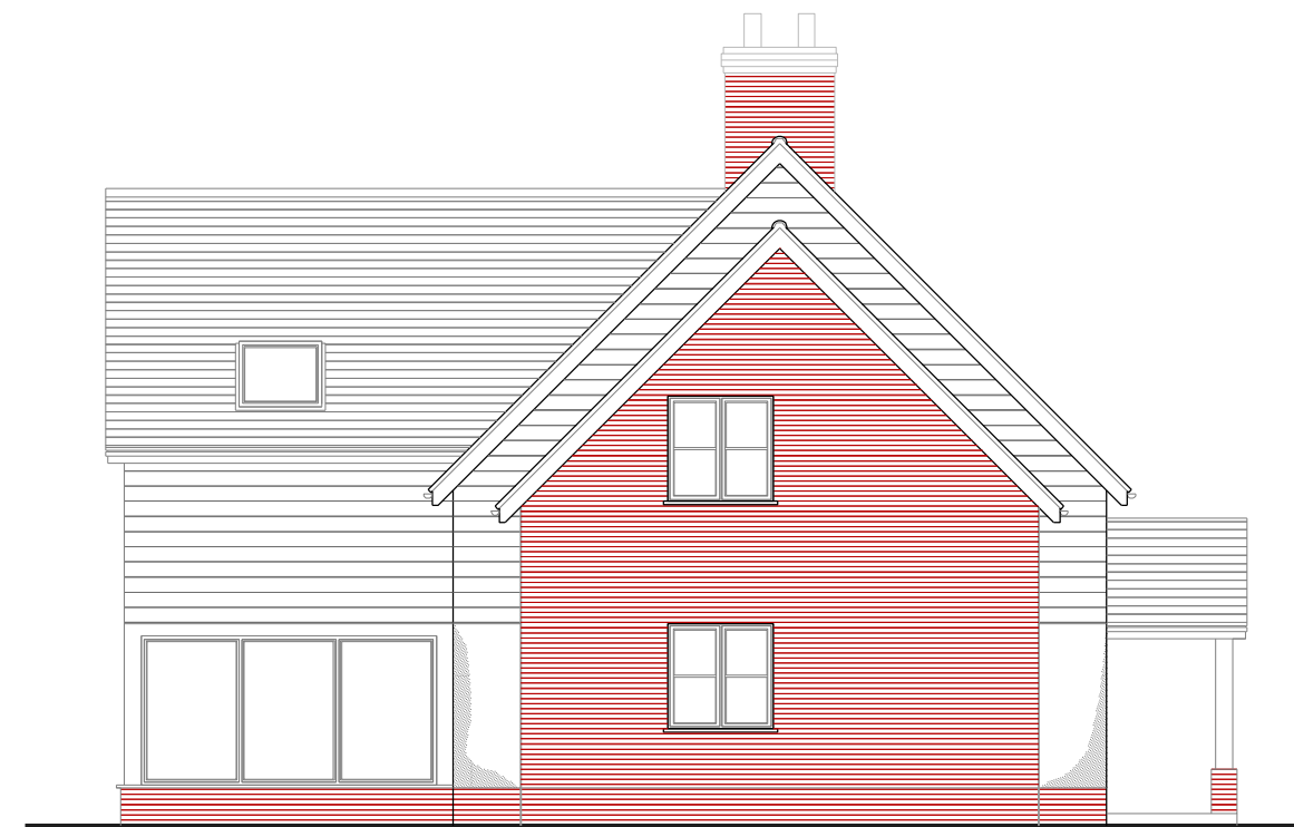
North Elevation Scale 1:100